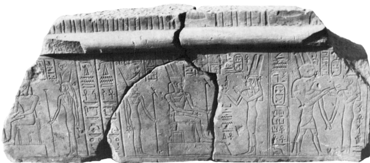
B. — Lintel of Shepenwepet.