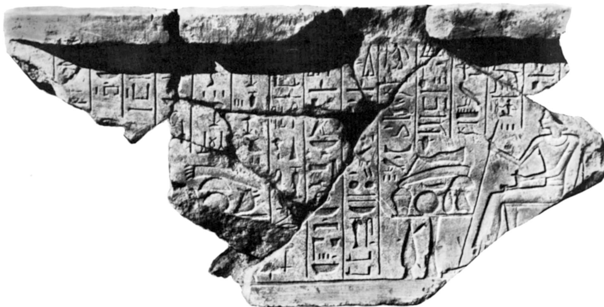
A. — A monument of the overseer of the controllers of the army, Amenhotep.