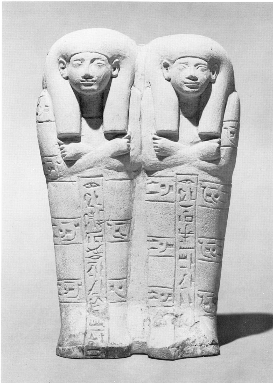
The shawabti box lid of the chief steward Nia (Iniuya), (courtesy Museum of Fine Arts, Boston).