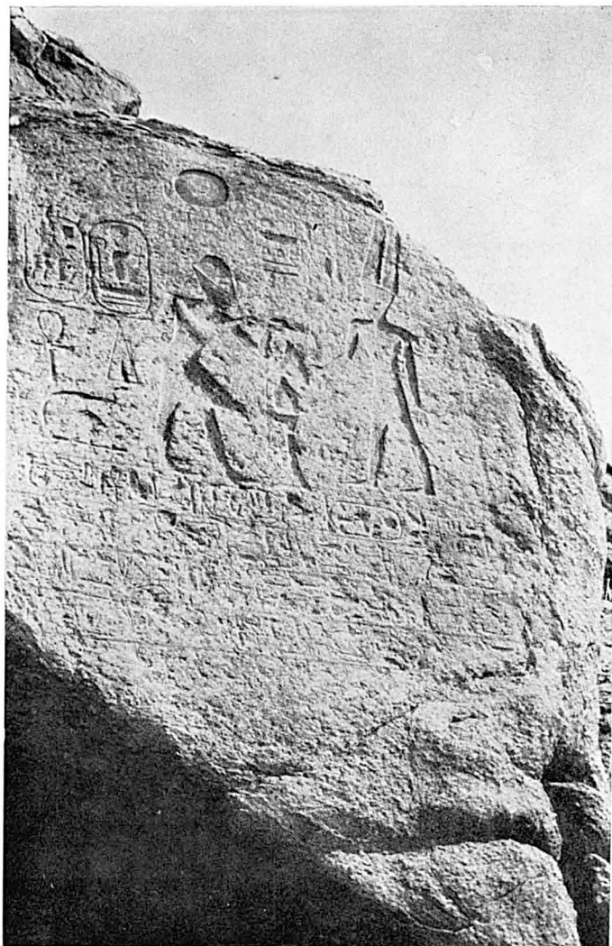
Stela speaking of making big statues in the IXth year of Sethos I.