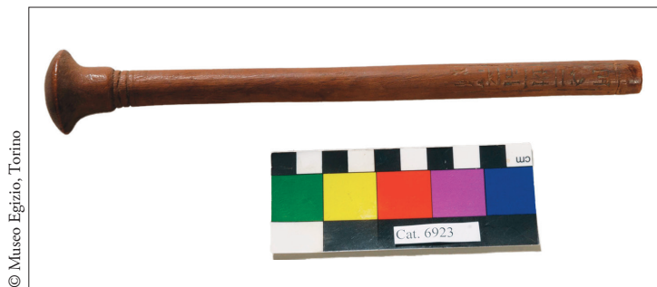
FIG. 14. Fan handle of Wennefer Cat. 6923 (Museo Egizio, Torino).

Furthermore, two additional and previously unknown pieces found in Magasin 23 at Deir el-Medina along with DeM_2022_M25_109 deserve consideration. Although their fragmentary condition does not allow a definitive identification, their characteristics suggest they may be fan handles. The first specimen, DeM_2022_M25_120 (Fig. 15), measuring 10cm in width, exhibits a classic palmiform shape and displays slight traces of a painted polychrome decoration, consisting of three red dots which appear to be covered by a layer of blue pigment applied over the entire surface. The only element that may link it to the previously mentioned hw -fan is the presence of three dowel holes drilled in the upper part. The second fragment, DeM_2022_M25_121 (Fig. 16), measures 11cm in height and also displays a palmiform shape, with an elongated semicircular element that can be compared to the mounting piece of Sennefer’s fan. Both, however, are made from local timbers: the first from sycamore fig ( Ficus sycomorus L.), the second from acacia ( Vachellia nilotica L.). 47