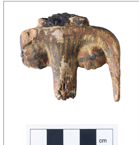
FIG. 2. Fragment of mirror handle from Deir el-Medina S. 7593/1 (Museo Egizio, Torino).

The object in question does bear a resemblance to certain mounting pieces for New Kingdom mirror handles from the site (Fig. 2); 8 however, it is the upper joint part that distinguishes its function. On mirror handles, this joint consists of a rectangular hole for the insertion of the metal disc. In the case of DeM_2022_M25_109, there are three cylindrical elements protruding from the top, two of which are hollow and partially intact. The absence of mirror handles constructed in this particular manner, coupled with the small dimensions of the holes (Diam. 0.3cm; D. 1.4cm), would necessitate a metal disc with two extremely thin projecting tangs, a feature not identified thus far. 9 Consequently, this leads to the exclusion of its function as a mirror handle, suggesting instead the possibility that the object represents a specific type of fan handle not previously recognised in the material culture.