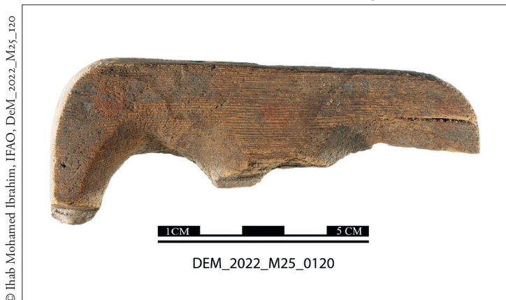
FIG. 15. Wooden fragment.