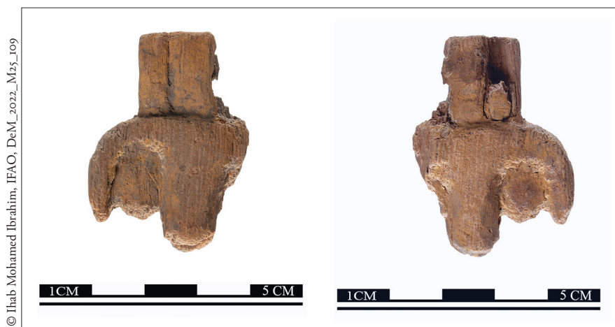
FIG. 1. Front and back views of the wooden fragment.

The object inventoried as DeM_2022_M25_109 is the mounting element for a handle, decorated in relief with a distinctive composite iconographic motif that incorporates a papyrus umbel with rosettes in the volutes (Fig. 1). The fragment is crafted from a common local timber, sycamore fig ( Ficus sycomorus L. ), 7 and is of relatively small dimensions, measuring 1.3 cm in thickness, 4.0 cm in height. Only 3.0cm of its original length have been preserved; however, considering that its right side is symmetrical, it can be estimated that it originally measured approximately 4.0cm. A drilled dowel hole is present at the bottom of the base, intended for the insertion of the staff that would have served as a handle.