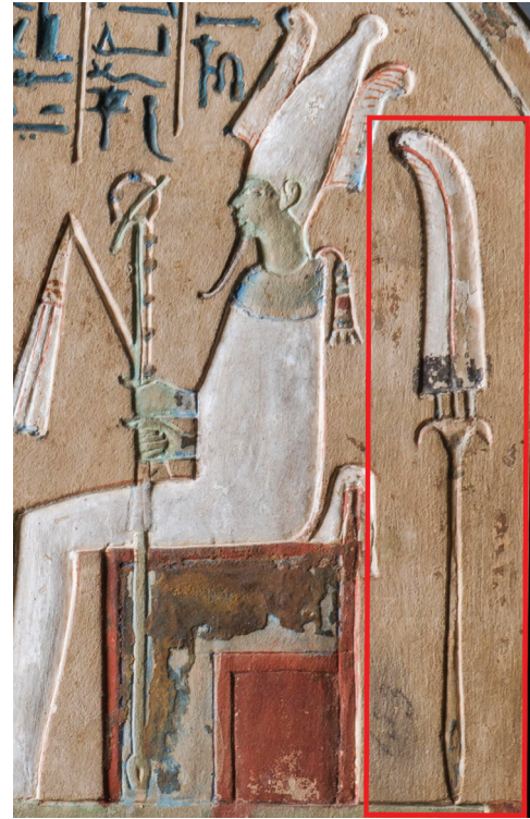
FIG. 6. hw -fan standing behind Osiris from the stela of Djehutynefer (Cat. 1639, Museo Egizio, Torino).

A significant piece of evidence further supporting the function of this piece as a fan handle is provided by a carved Assyrian ivory of the Metropolitan Museum of Art (54.117.3), 19 found in the Palace of Ashurnasirpal II at Nimrud, and dated to the late 8th and