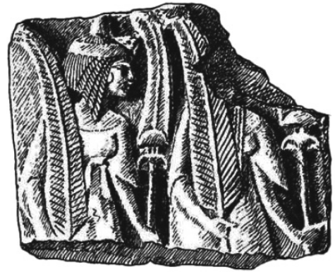
FIG. 9. Terracotta tile with royal attendants holding hw -fans (after Brunton, Engelbach 1927, pl. 28).

An example that closely resembles the fan handles under investigation can be found on a terracotta tile in the Amarna style, discovered in Tomb 474 at Gurob (Fig. 9). 31 This illustration depicts female royal attendants holding hw -fans characterized by a handle embellished with a composite motif of a papyrus umbel and rosettes in the recesses of the volutes, similar to those found at Deir el-Medina. Although the fan continued to be predominantly depicted in court or religious scenes, by the Amarna period it was no longer exclusively associated with the “Fanbearer on the right of the king” and its appearance in other contexts suggests a broader use.