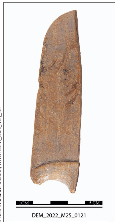
FIG. 16. Wooden fragment.