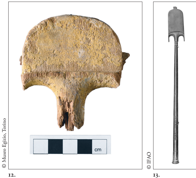
FIG. 12. Fragment of fan handle S. 07593/2 (Museo Egizio, Torino).