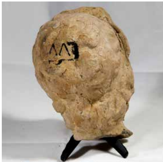
FIG. 4. Kom Oushim Museum, Inv. 886, back view.