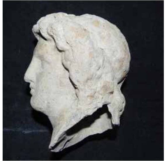
FIG. 3. Kom Oushim Museum, Inv. 886, left side view.