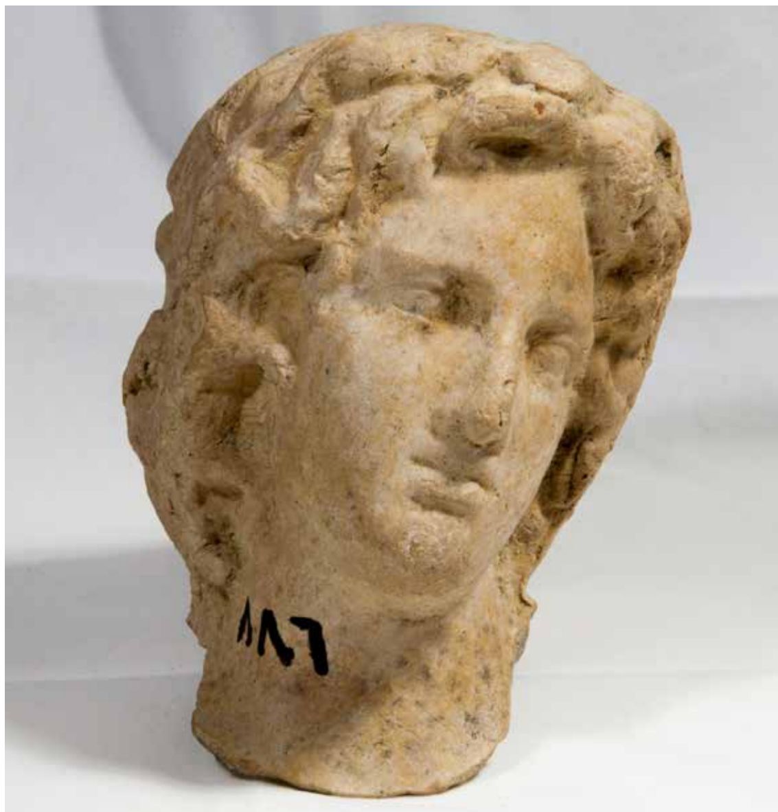
FIG. 1. Kom Oushim Museum, Inv. 886, frontal view.