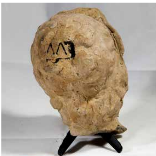
FIG. 4. Kom Oushim Museum, Inv. 886, back view.