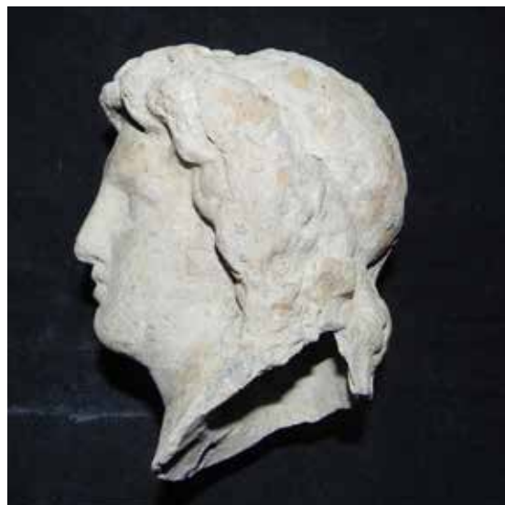
FIG. 3. Kom Oushim Museum, Inv. 886, left side view.