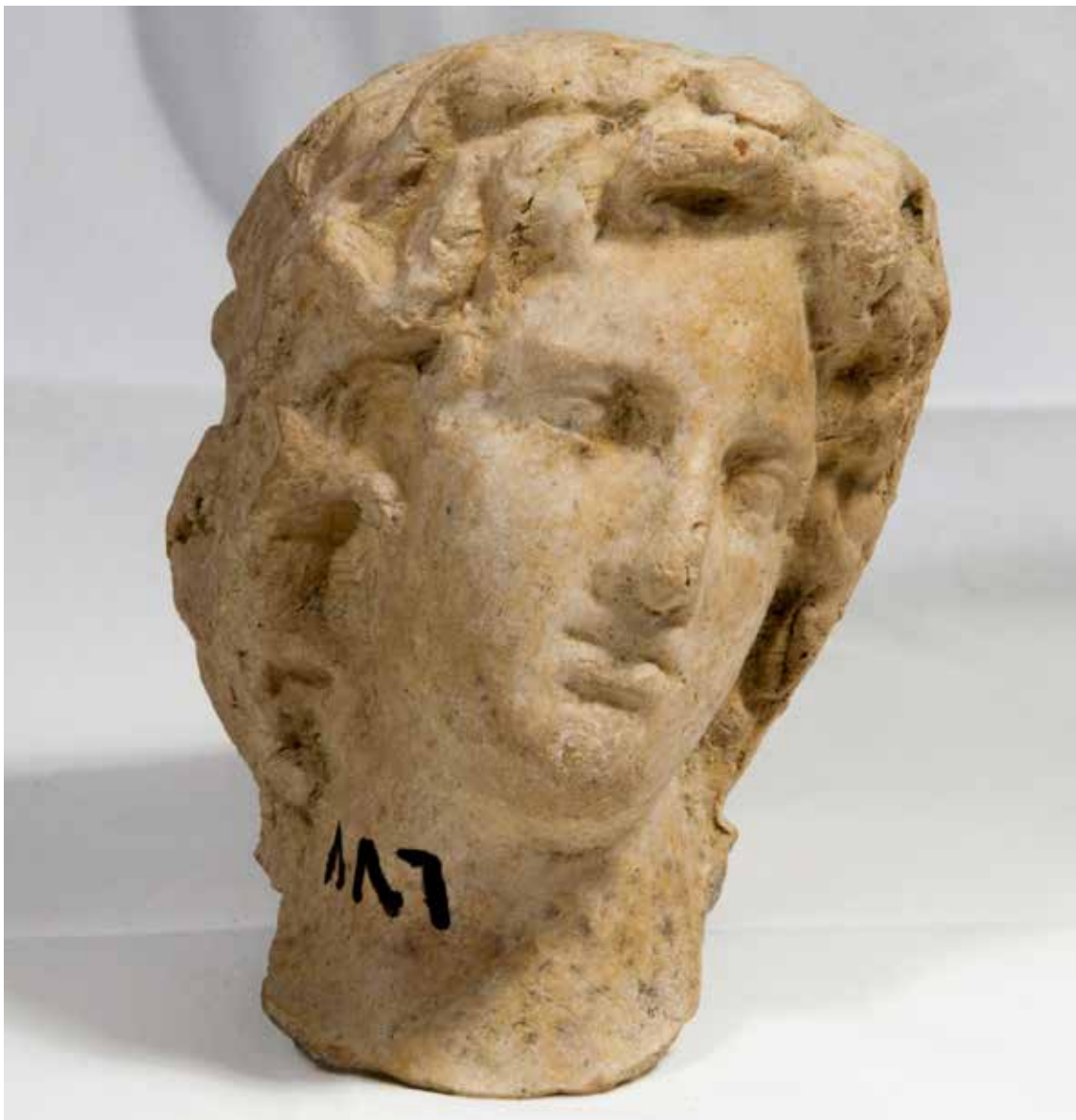
FIG. 1. Kom Oushim Museum, Inv. 886, frontal view.