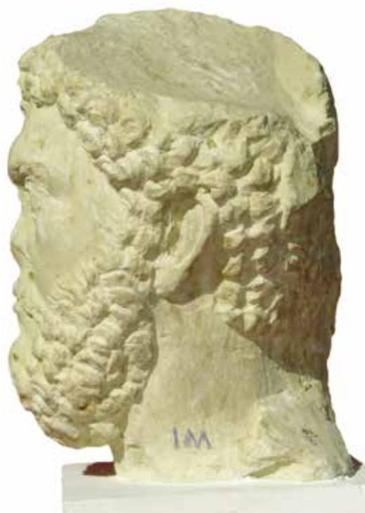
FIG. 4. Kom Oushim Museum, Inv.188, left side view.