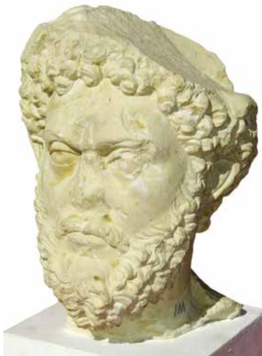
FIG. 5. Kom Oushim Museum, Inv.188, frontal 3/4 view.