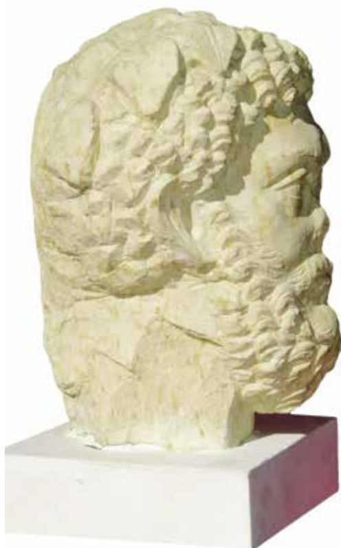
FIG. 2. Kom Oushim Museum, Inv.188, right side view.