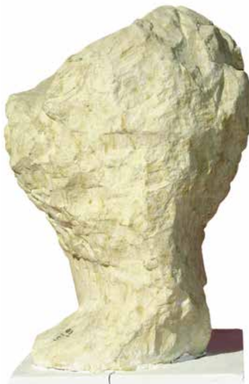
FIG. 3. Kom Oushim Museum, Inv.188, back view.