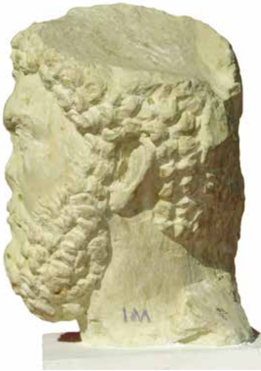
FIG. 4. Kom Oushim Museum, Inv.188, left side view.