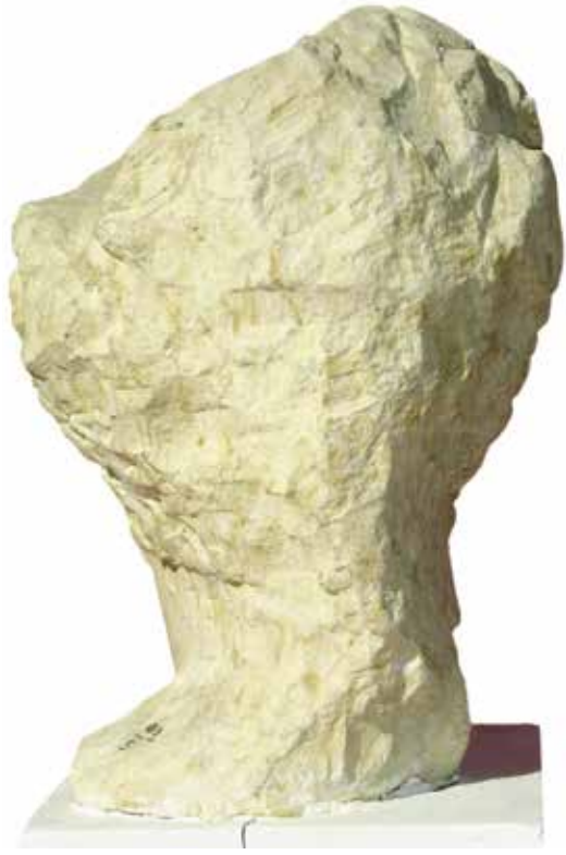
FIG. 3. Kom Oushim Museum, Inv.188, back view.