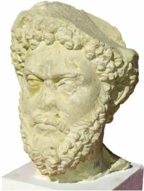
FIG. 5. Kom Oushim Museum, Inv.188, frontal 3/4 view.