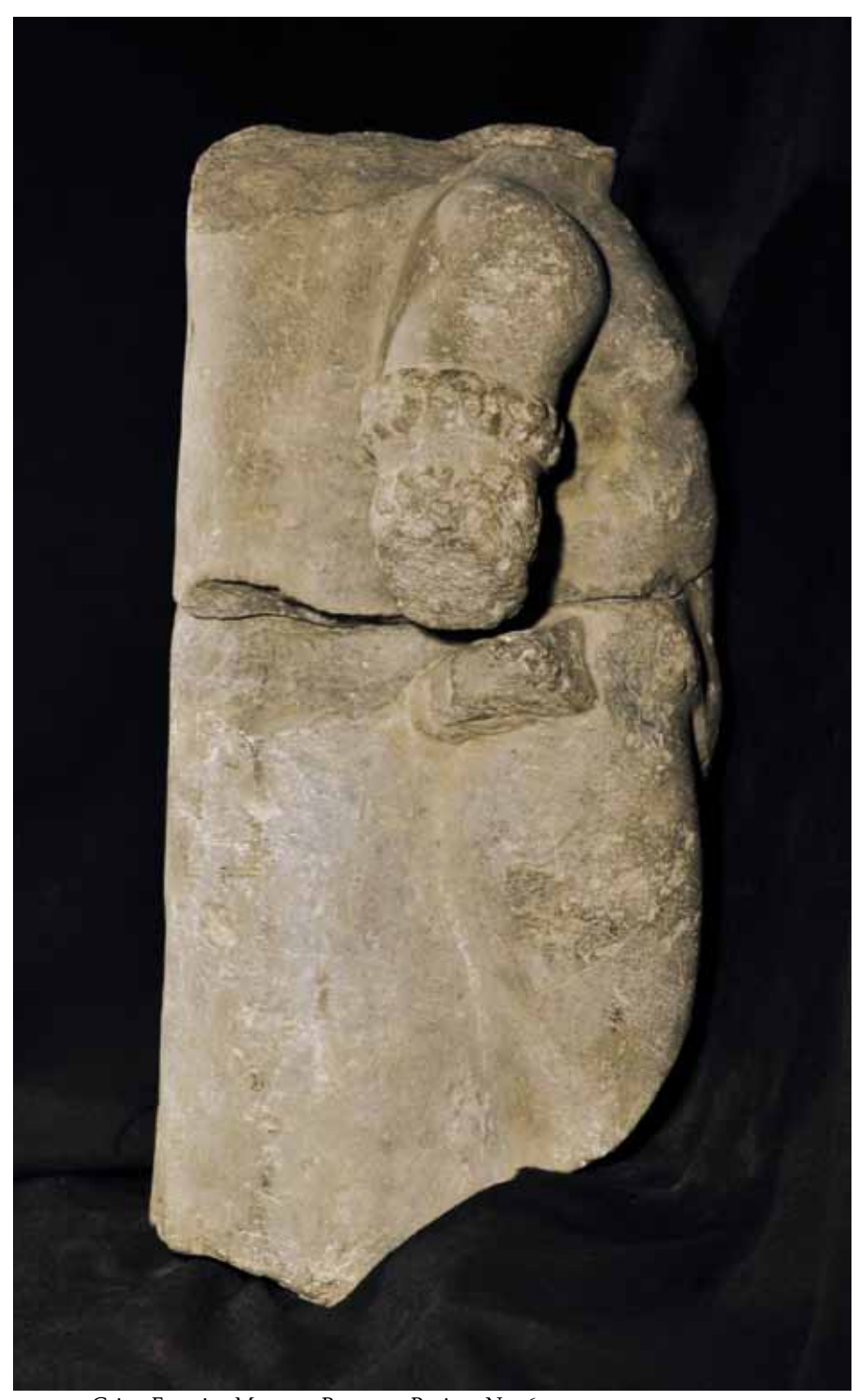
FIG. 2. Cairo, Egyptian Museum, Basement Register N. 967.