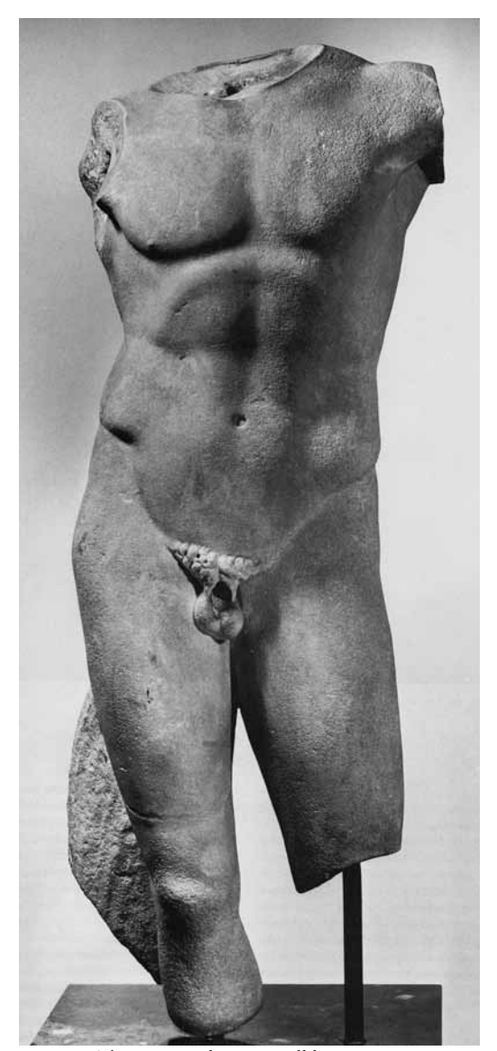
FIG. 6. The Ex-Lansdowne small boxer statue, after Bol 1990, fig. 17.