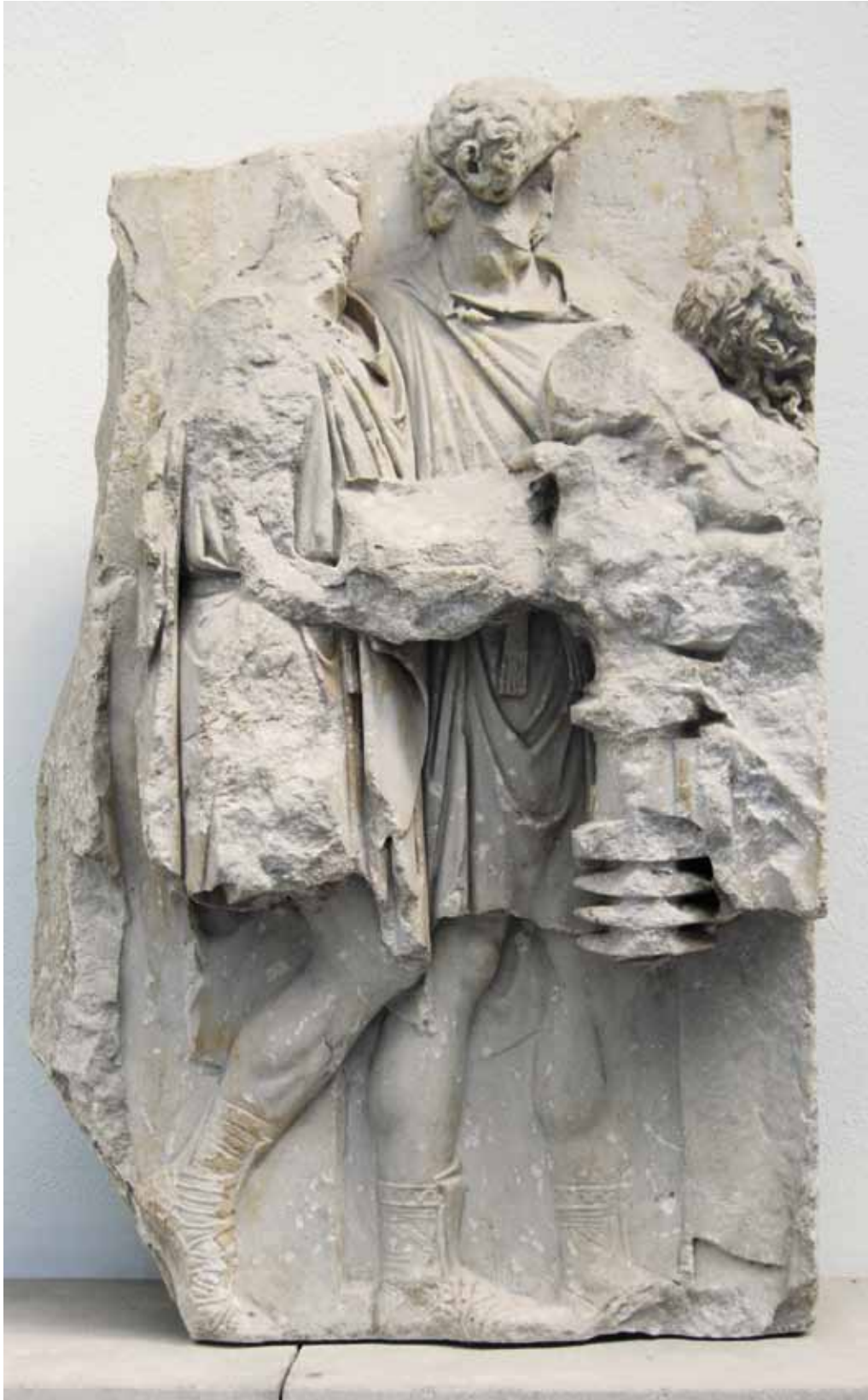
FIG. 19. The Telephus Frieze, Funerary bed scene, after http://www.flickr.com/photos/24729615@Noo/7197866330/sizes/k/in/photostream/ .