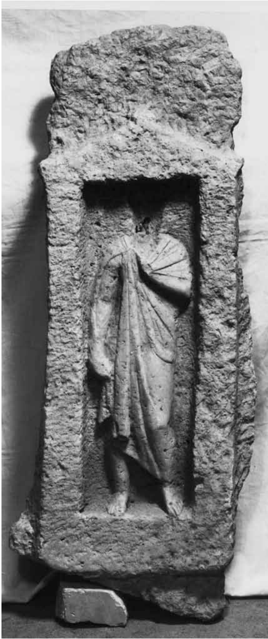
FIG. 16. Funerary stele, Alexandria GRM 27903.