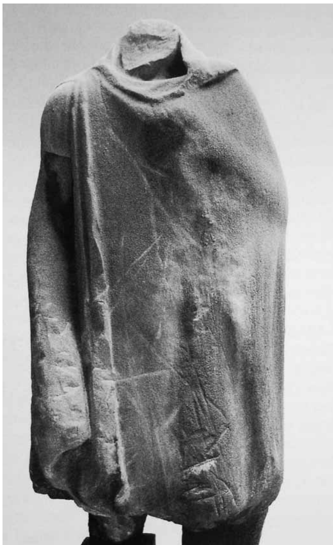
FIG. 8. Ephēbos, Museo Nazionale Romano 113205, after Andreae 2001. Abb. 15.