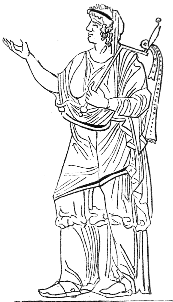
FIG. 11. Apulian Vase, Hermitage St Petersburg, after Toutain Sacerdos , Fig 5990.