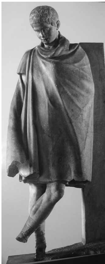
FIG. 7. The Tralleis Boy, Istanbul Museum 1191, after Andreae 2001, 3-4.