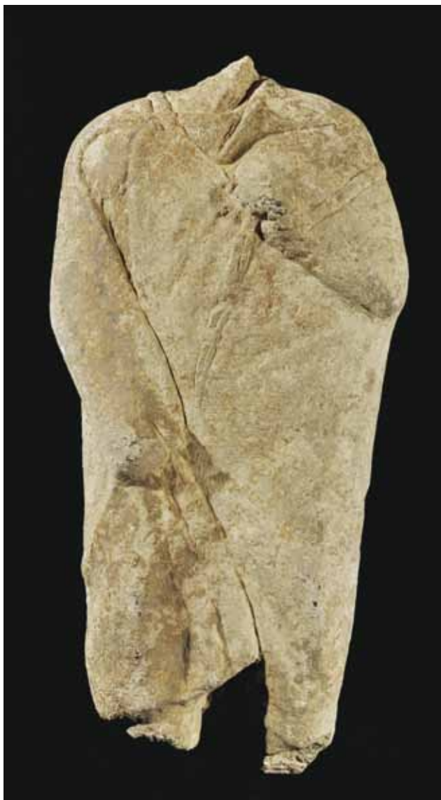
FIG. 1. Cairo J.E. 45055B.