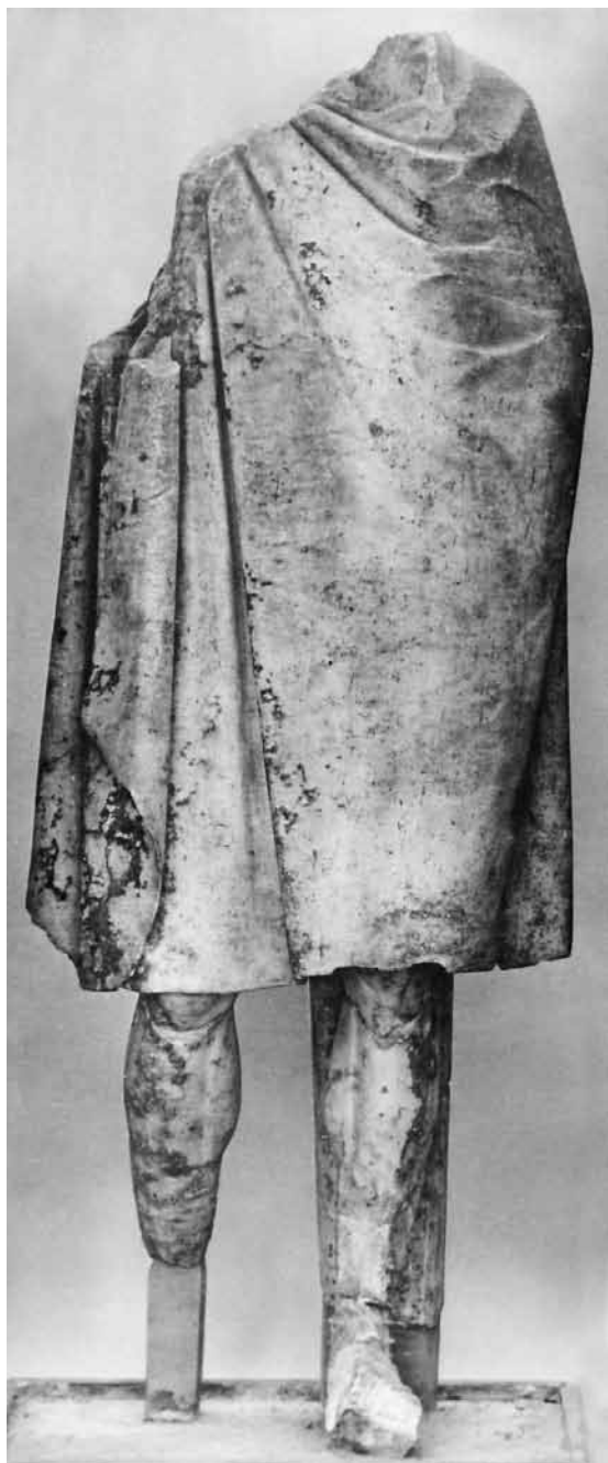
FIG. 10. Daochos I statue, Delphi Museum 1828, after Dohrn 1968, taf. 29.