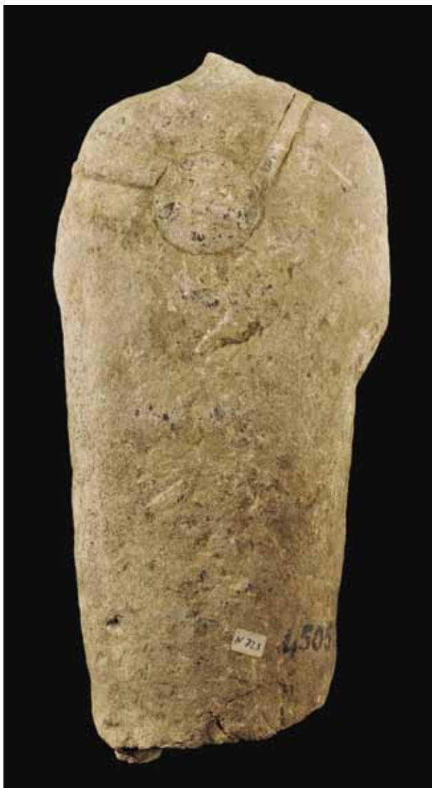
FIG. 2. Cairo J.E. 45055B.