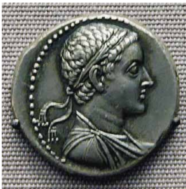
FIG. 18. Ptolemaic coin, http://commons.wikimedia.org/wiki/File:Tetradrachm_Ptolemy_V.jpg