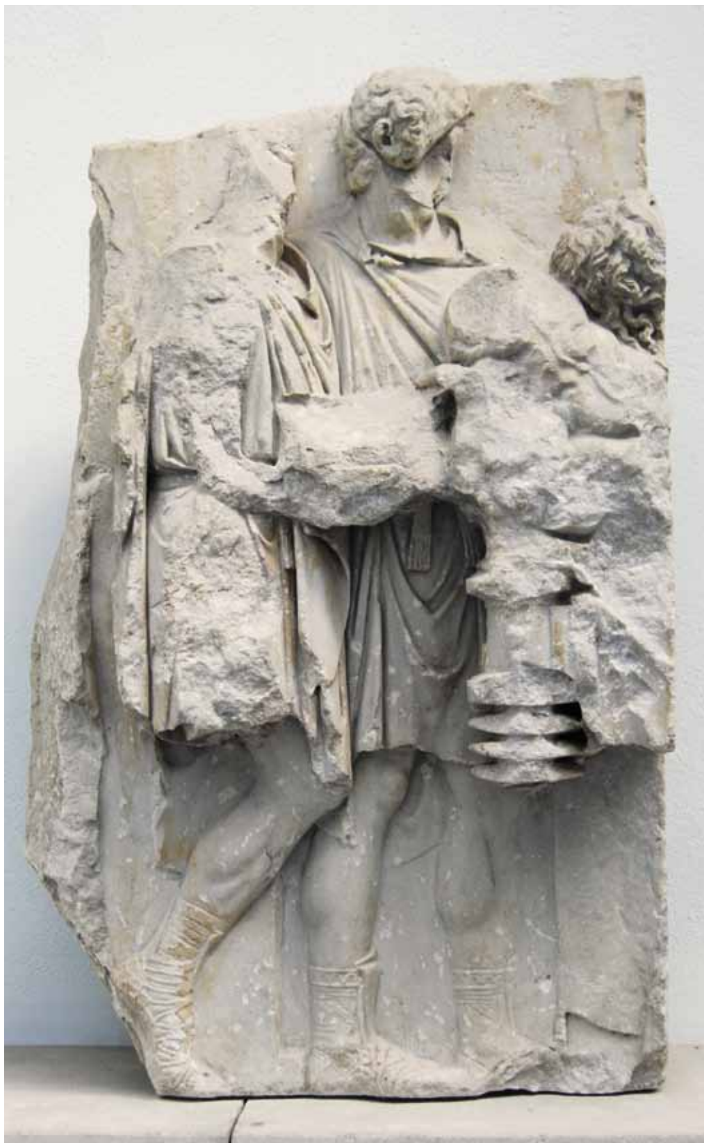
FIG. 19. The Telephus Frieze, Funerary bed scene, after http://www.flickr.com/photos/24729615@Noo/7197866330/sizes/k/in/photostream/ .