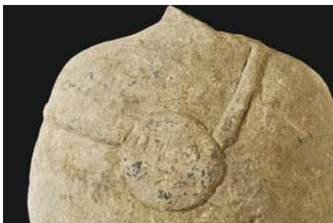
FIG. 5. Cairo J.E. 45055 B.