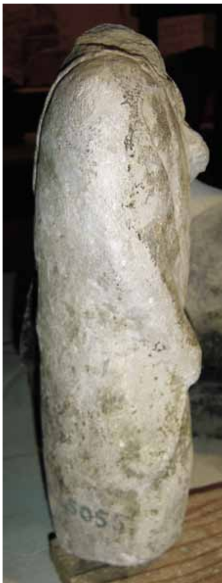
FIG. 4. Cairo J.E. 45055 B.