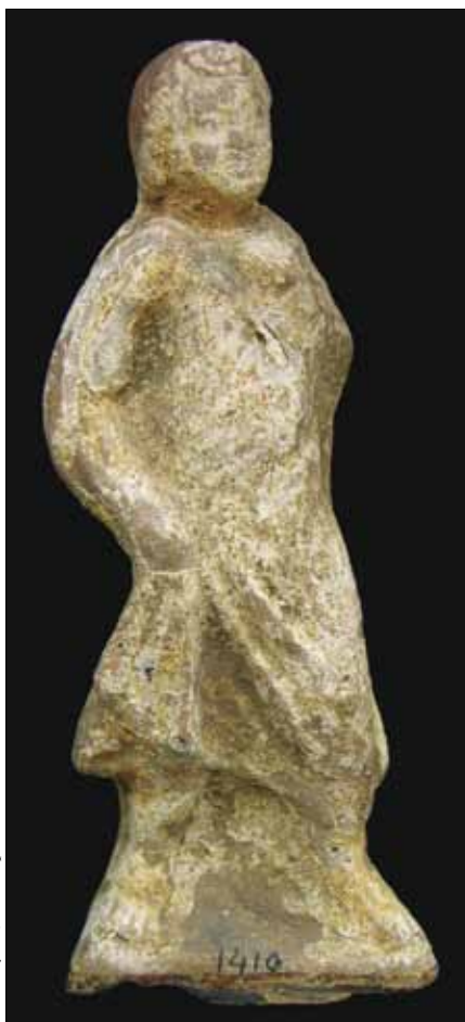
FIG. 14. Chamydophoros Boy, Alexandria GRM 25711.

FIG. 15. Terracotta statuette, Alexandria GRM 9263.