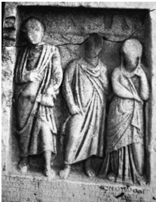
FIG. 17. Funerary stele, Izmir Basmahane Museum, Inv.165, after Pfuhl-Möbius 1979, no. 640.