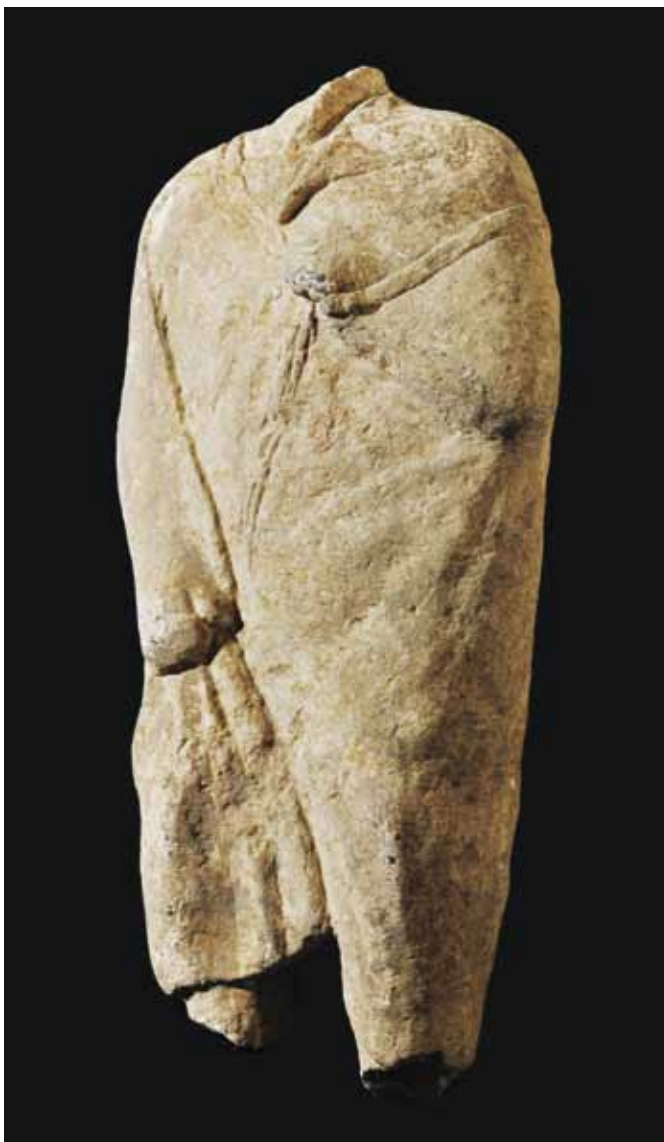
FIG. 5. Cairo J.E. 45055 B.