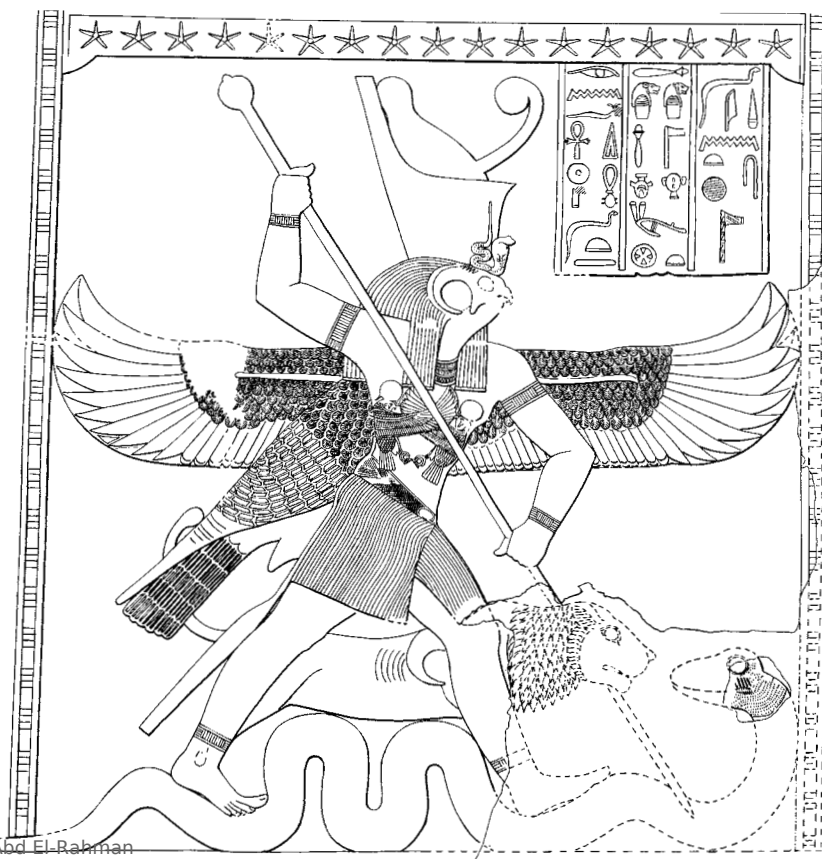
FIG. 6. Seth of Hibis spearing Apopis, scale 1:20, after N. de G. Davies,

The Temple of Hibis in el Khargeh Oasis, III, pl. 42.