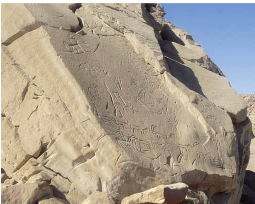
FIG. 1. Dakhla, al-Aqula/Wadi al-Gemal, the hill, view W/E.