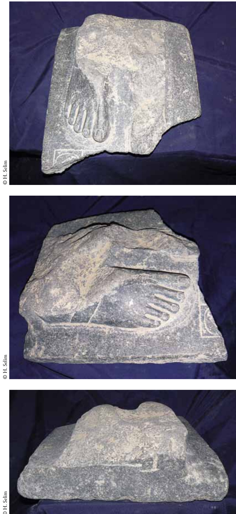
FIG. 1. Base of a standing statue of Mutemwia, Cairo, Egyptian Museum.

BIFAO 111 (2011), p. 323-334 Hassan Selim Two Royal Statue Bases from Karnak in the Basement of the Egyptian Museum in Cairo. © IFAO 2026