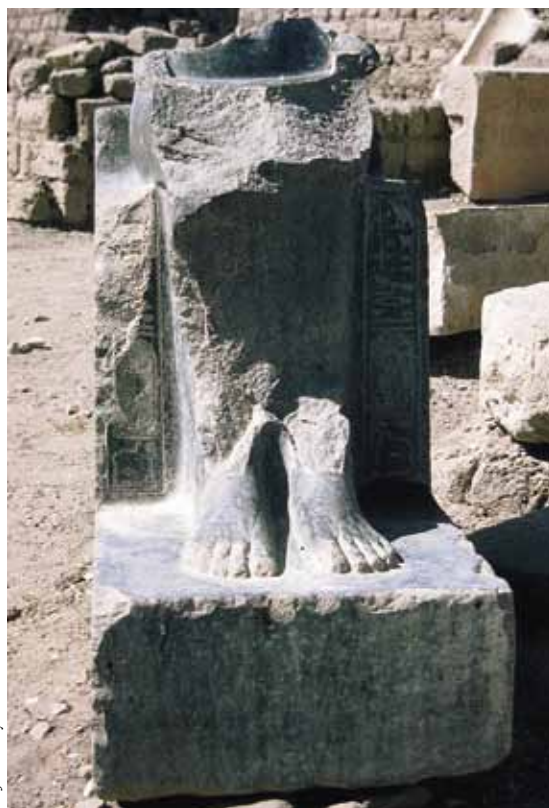
FIG. 2. Black granite seated statue of Mutemwia, Ramesseum magazine.