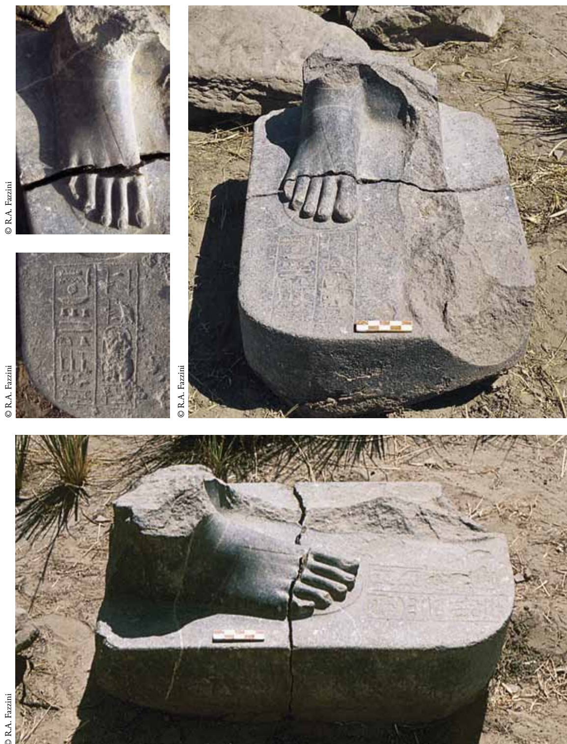
FIG. 3. Black granite base for a standing statue, R.A. Fazzini probably of Mutemwia, Cairo, NMEC.