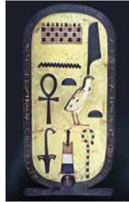
Lid of box belonging to Tutankhamun, Carter 269.