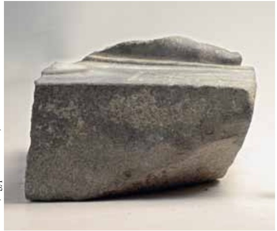
© Cairo, Egyptian Museum, A. Amin