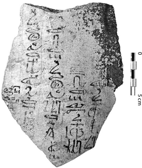
FIG. 1. Photograph of the Amheida ostrakon. 7