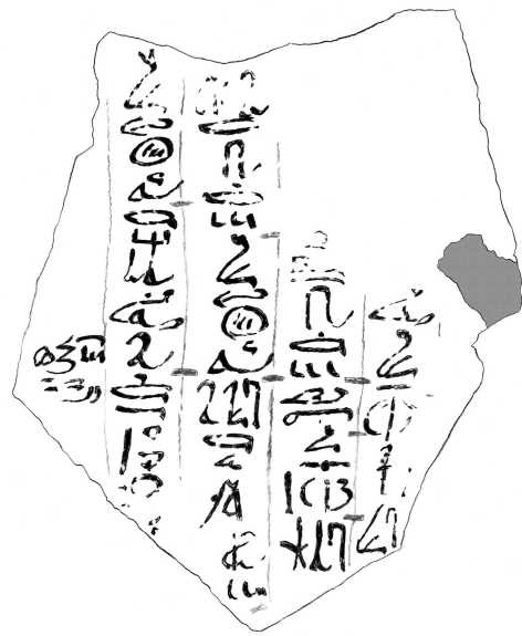
FIG. 2. Facsimile drawing.