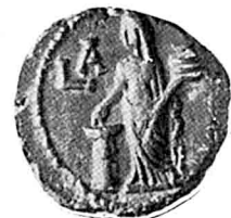
Eusebeia holds acerra and drops incense on altar (L.A).