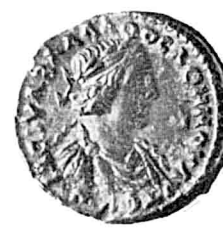
9 A. Aurelianus