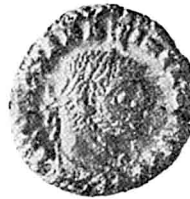
129 A, B. Maximianus