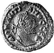
116 A, B. Diocletianus