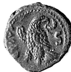
Eagle (ἔτους S).