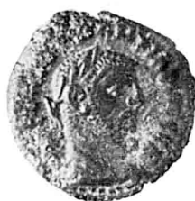
97 A, B. Diocletianus