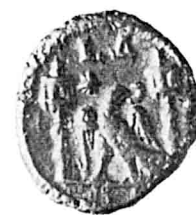
76 A, B. Diocletianus Eagle between vexillae (L.Δ).