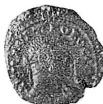
31 A, B. Probus