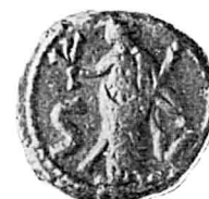
80 A, B. Diocletianus