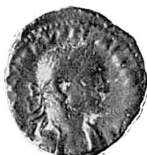
3 A, B. Aurelianus