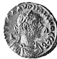
9 A. Aurelianus