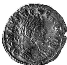
30 A, B. Probus