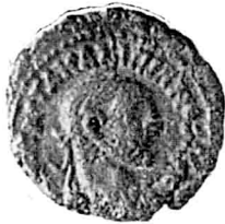
123 A, B. Maximianus