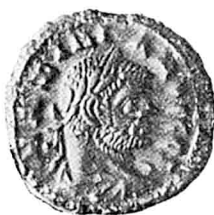
147 A, B. Maximianus