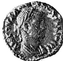
144 A, B. Maximianus