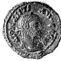
118 A, B. Diocletianus