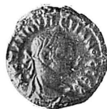
50 A, B. Numerianus