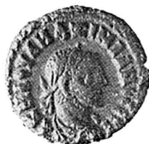
153 C, D. Maximianus