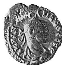
50 C, D. Numerianus