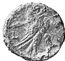
1 A, B. Claudius II