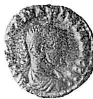
178 A, B. Maximianus