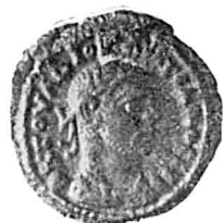
96 A, B. Diocletianus