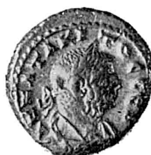
10 A, B. Tacitus