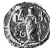
Standing Dikaosyne (L.A).