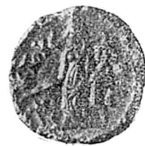
Tyche (ἔτους Γ).