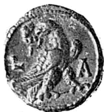
3 A, B. Aurelianus