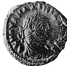
139 A, B. Maximianus