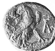
2 A, B. Quintillus