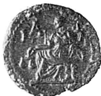
Seated Dikaiosyne (L.A).