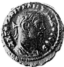
130 A, B. Maximianus