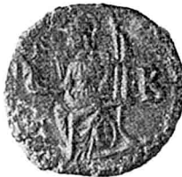
Athena seated on throne (L.B).