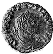
172 A, B. Maximianus