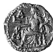
Seated Dikaiosyne (L.A).