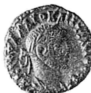
95 C, D. Diocletianus