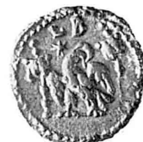
Eagle between vexillae (L.B).