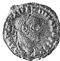
170 A, B. Maximianus