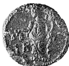
Standing Dikaiosyne (L.B).