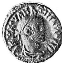
139 C, D. Maximianus