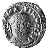
43 A, B. Karinos