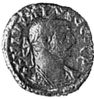
34 C, D. Probus