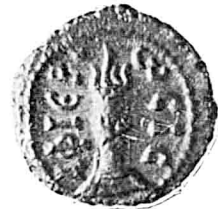
Flaming altar (Αφιέρωσις).