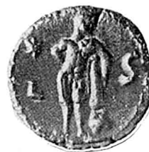
Herakles standing in repose (L.S).