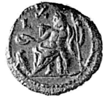
Zeus seated holds patera (L.Z).