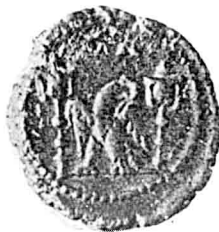
Eagle between vexillae (L.A).