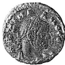
150 A, B. Maximianus