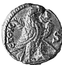
Eagle (ἔτους S).