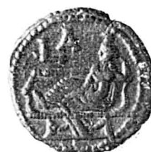
Tyche recumbent (L.A).