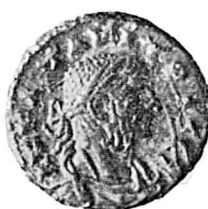
11 C, D. Tacitus