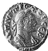
14 A, B. Probus