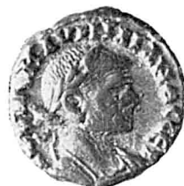
5 A, B. Aurelianus