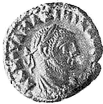
127 A, B. Maximianus