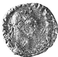
80 C, D. Diocletianus