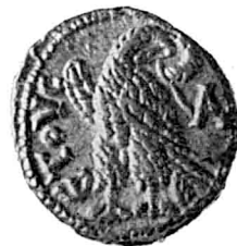
Eagle (ἔτους A).