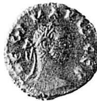
41 A, B. Θεῶν Καρῶ Σεβ