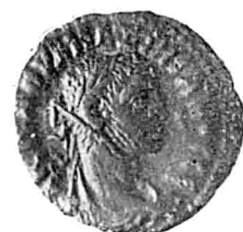
174 C, D. Maximianus