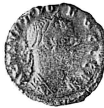
36 A, B. Probus