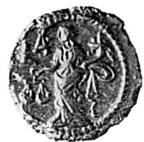
Standing Dikaiosyne (L.A).