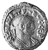
13 A, B. Probus