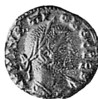
32 A, B. Probus