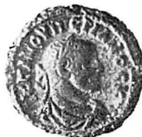
53 A, B. Numerianus