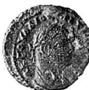
96 C, D. Diocletianus