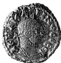
45 C, D. Karinos