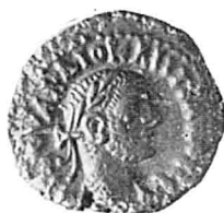
95 A, B. Diocletianus