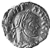
150 C, D. Maximianus