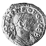
34 A, B. Probus