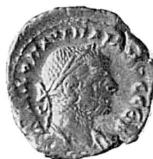
4 A, B. Aurelianus