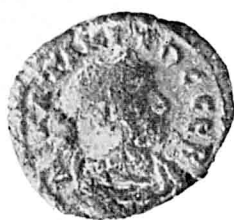
11 A, B. Tacitus