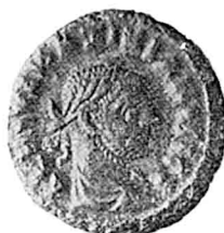
153 A, B. Maximianus