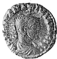
178 A, B. Maximianus