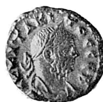
10 C, D. Tacitus