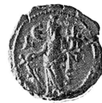
Tyche wearing modius, holds rudder and cornucopiae (L.Ε).