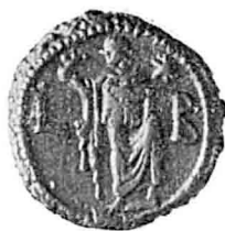
Standing Elpis (L.B).