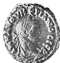
52 A, B. Numerianus