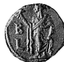
Standing Elpis (L.B).