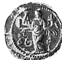
Standing Dikaosyne (L.A).