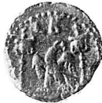
Eagle between vexillae, above (L.B).