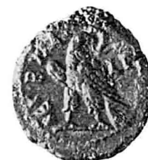
Eagle. Αεγ(ατος) B. Τραι(ανος) (L.Γ).