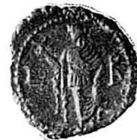
Standing Elpis (L.F).