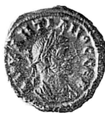
86 A, B. Diocletianus