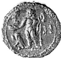
Zeus standing. Eagle at his feet (L.H).