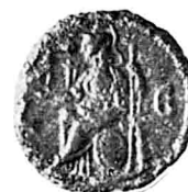
67 A, B. Diocletianus