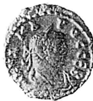
37 C, D. Karos