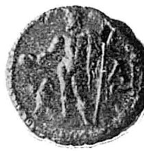
Zeus holding sceptre. Eagle at his feet (L.A).