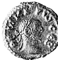
42 A, B. Θεῶν Καρῶ Σεβ