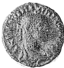
174 A, B. Maximianus