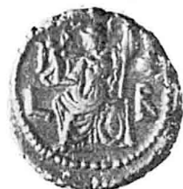
Seated Athena (L.B).