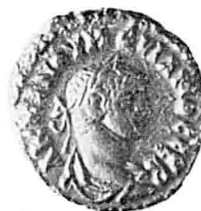
49 A, B. Numerianus