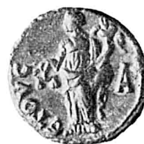
Dikaiosyne (ἐπινομία A).