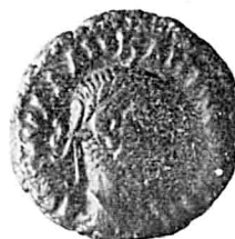
114 A, B. Diocletianus