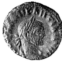
125 A, B. Maximianus