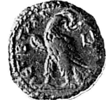
Eagle. Λεγ(ατος) Β. Τραι(ανος).