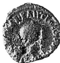
106 A, B. Diocletianus