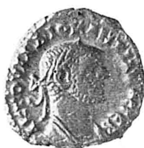
108 A, B. Diocletianus