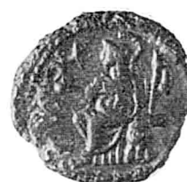
Seated Homonoia (L.S).