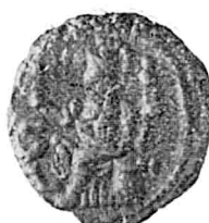
Seated Athena holding Nike (L.S).