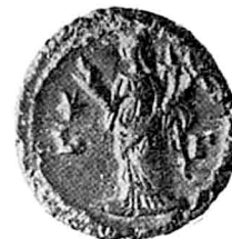
Homonoia holding cornucopiae (L.Γ).