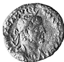
2 A, B. Quintillus