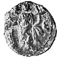
Dikaiosyne holding scales and cornucopiae (L.Ε).