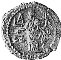
Standing Dikaiosyne (L.A).