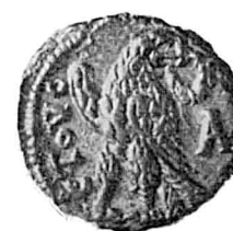
Eagle (ἔτους A).