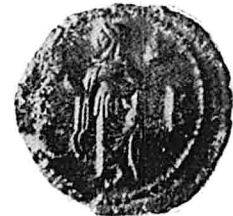
Elpis holding a flower (L.B).