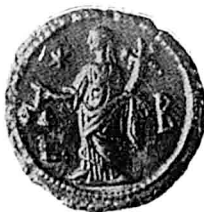
Dikaiosyne holding scales and cornucopiae (L.B).