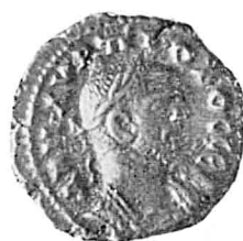
32 C, D. Probus