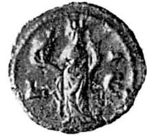
Alexandria holding head of Sarapis (L.Ε).