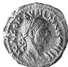
(7) A, B. Aurelianus