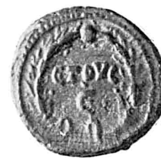
Laurel wreath (ἔτους Ε).