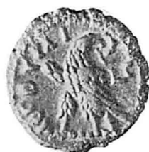
Eagle. Αεγ(ατος) B. Τραι(ανος) (L.Γ).