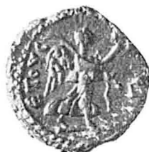
Nike (ἔτους Γ).