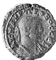
29 A, B. Probus