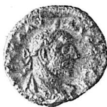
1 A, B. Claudius II