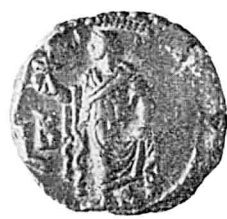
Standing Elpis (L.B).