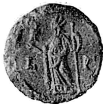
Alexandria holding head of Sarapis (L.Γ).