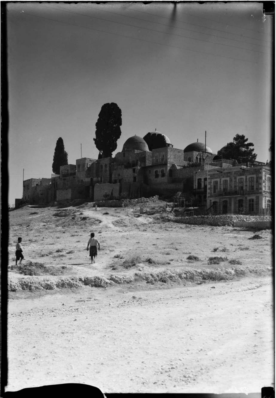
Fig. 2. Elevated View of the Takiyya of Šayḥ Abū Bakr, Aleppo.