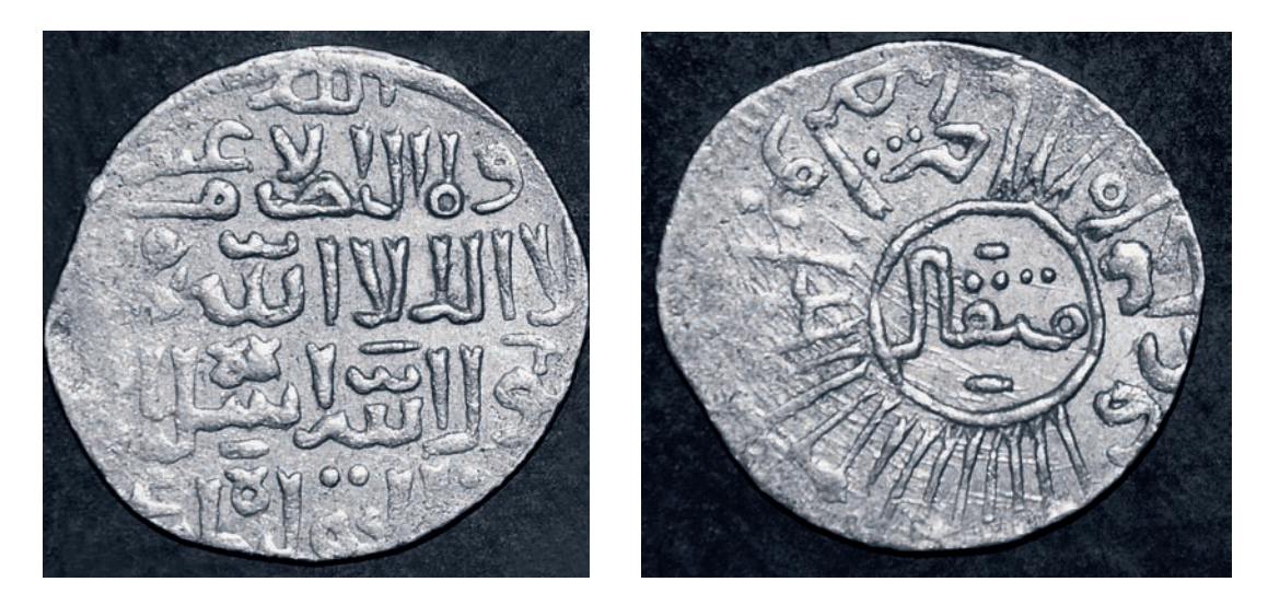
Figure 10. Mamlūk al-Nāṣirī style dinar, al-Mu'ayyad Šayḥ, dinar, al-Qāhira, 815 ( Dār al-Kutub cat. 2882 / reg. 2317); Mamlūk mit॒qāl style dinar, al-Mu'ayyad Šayḥ, al-Qāhira, 821 (Dār al-Kutub 2883 / reg. 2318). Reproduced with the permission of the Egyptian National Library.

38. Details of this reform can be found in Bacharach, "The Dinar versus the Ducat", p. 88-89.