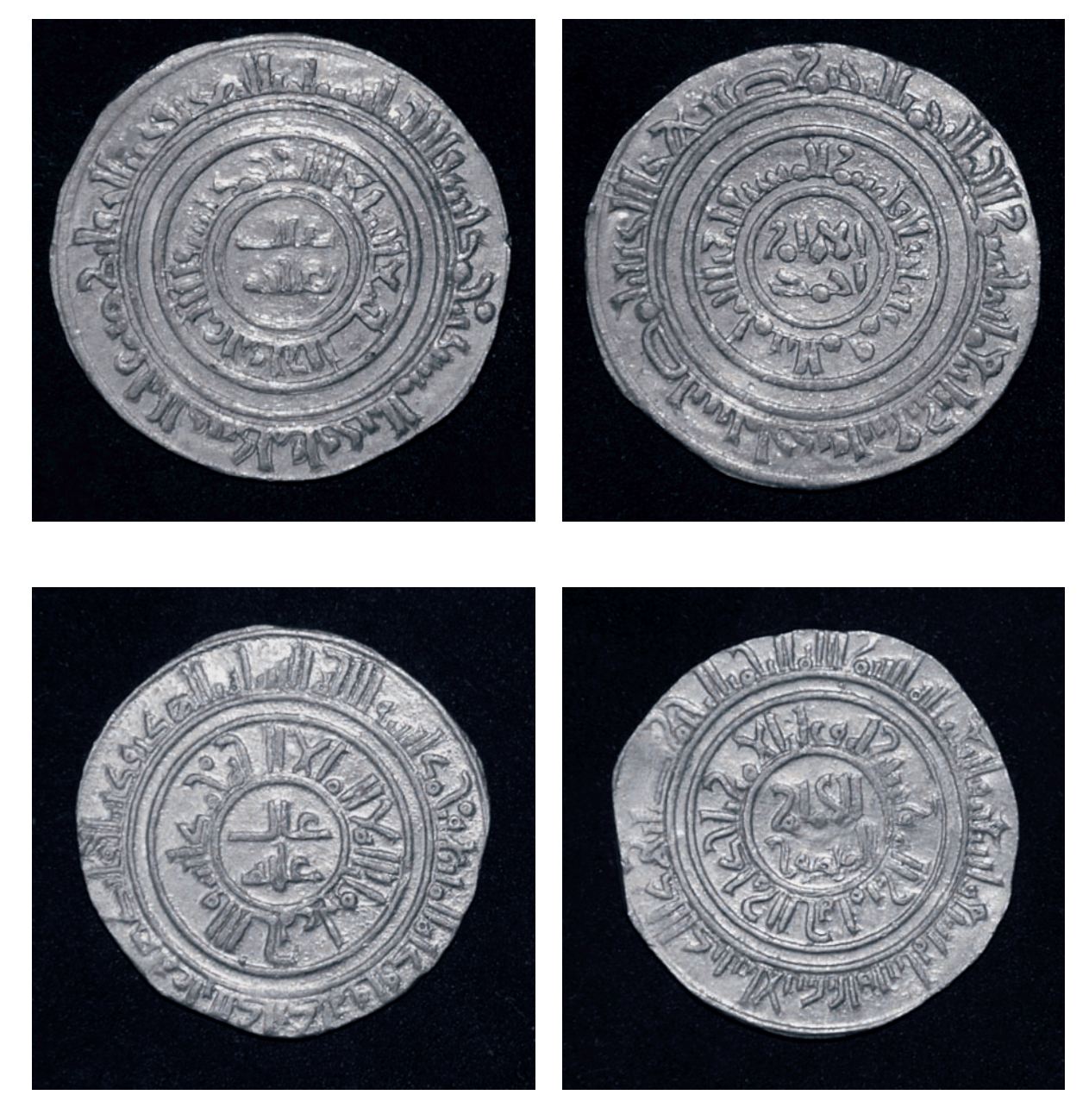
Figure 2. Fatimd "bullseye" style dinar, al-Musta'lī billāh, Miṣr, 491 (Dār al-Kutub cat. 2145 / reg. 1601); Fatimid "bullseye" style dinar, al-Amīr bi-Aḥkam Allāh, al-Iskandariyya, 497 (Dār al-Kutub cat. 2146 / reg. 1611). Reproduced with the permission of the Egyptian National Library.