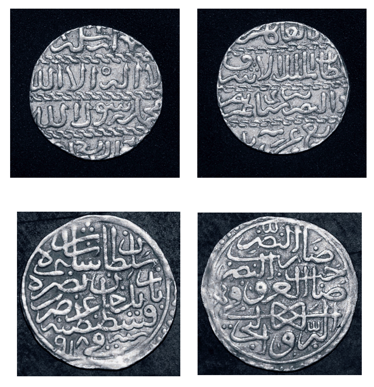
Figure 13. Mamlūk al-Ašrafī style dinar, al-Ašraf Barsbāy, dinar, al-Qāhira, 829 (Dār al-Kutub cat.2897 / reg. 4764); Ottoman sultani style gold coin, Selim I, Kostantaniye, 918 (Dār al-Kutub cat. 3476/ reg. 2502).

In comparing the two gold coins above it is easy to differentiate them without being able to read the script. The lines of text engraved on the Mamluk ašrafī are separated by horizontal rigid cables in an "s" or "z" pattern on both sides of the gold coin. The new Ottoman gold lacks these cables. The text on Ottoman sulțānī is laid out in a series of parallel horizontal lines. Therefore it is not necessary to read the text to distinguish the new Ottoman gold from those struck in Mamluk Egypt and Syria. If one read the texts, the Ottoman obverse field included "Sultan Mehmed son of Murad, Lord, May his victory be glorious; struck in