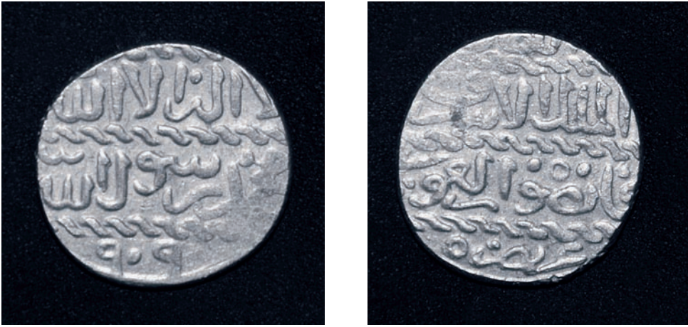
Figure 11. Mamlūk al-Ašrafī style dinar, al-Ašraf Barsbāy, al-Qāhira, 829 (Dār al-Kutub cat.2897 / reg. 4764); Mamlūk al-Ašrafī style dinar, al-Qanşūh al-Ġūrī, al-Qāhira, 909 (Dār al-Kutub cat. 3102 / reg. 4482).

Barsbāy, unlike his predecessors, had the gold resources to flood the market with ašrafī . The bullion for his new gold issues came from his successful raid on Cyprus in 829/1426 and his ransoming two years later for an exceptionally large sum of gold the Cypriot king. By minting large quantities of ašrafī dinars, which weighed slightly less than the ducat but were to be traded with the ducat on an equal basis, Barsbāy was able to have his new coinage dominate the market. It became the standard in weight and design for all dinars for the rest of the Mamluk period. The success of Barsbāy's action is also reflected in that the generic name