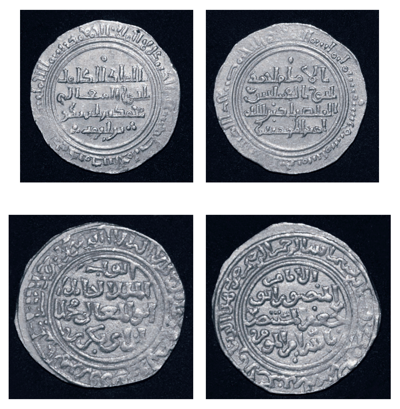
Figure 6. Ayyubid Abbasid Kufic style dinar, al-Malik al-Kāmil, al-Iskandariyya, 619 (Dār al-Kutub cat. 2385/ reg. 1853); Ayyubid Nashī style dinar, al-Malik al-Kāmil, al-Iskandariyya, 629 (Dār al-Kutub cat. 2387/1861).