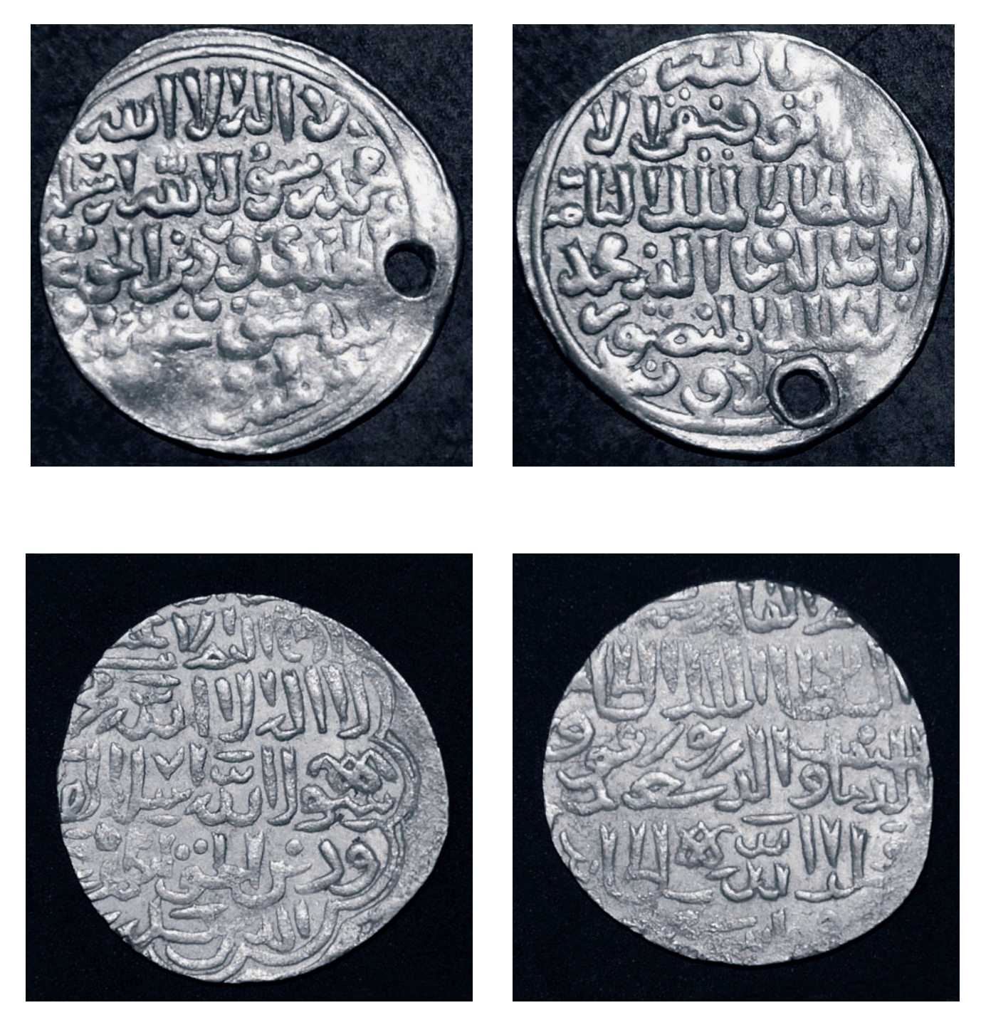
Figure 8. Mamlūk dinar, al-Nāṣir Muḥammad b. Qalāʿūn, Dimašq, [7]38 (Dār al-Kutub cat. 2596 / reg. 2057); Mamlūk dinar, al-Ṣāhir Barqūq, Dinar, al-Qāhira, 786 (Dār al-Kutub cat. 2845 / reg. 2275).