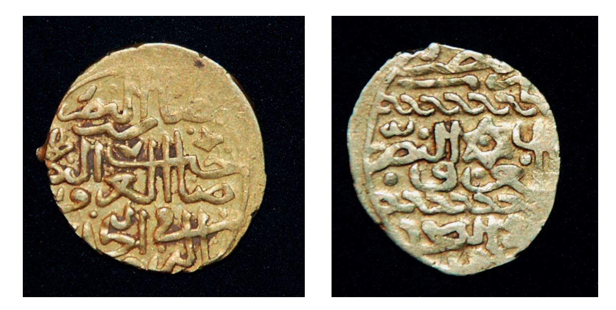
Figure 14. Reverse, Ottoman sultani style gold coin, Selim I, Mișt, 923 (Dār al-Kutub cat. 3477 / reg. 4542); reverse, Ottoman al-Ašrafī style gold coin, Selim I, Mișt, 923 (Dār al-Kutub cat. 3479 / reg. 4541). Reproduced with the permission of the Egyptian National Library.