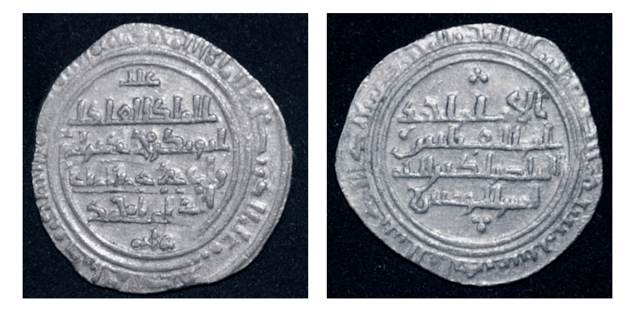
Figure 5. Ayyubid Abbasid Kufic style dinar, al-'Ādil Abū Bakr I dinar al-Qāhira, 607 (Dār al-Kutub cat 2347/ 1815).

The one major development for the remaining years of Ayyubid rule in Egypt is the expanded and sustained use of Naskh script for gold, silver, and copper coins, the last metal appearing in Egypt in significant quantities for the first time after many centuries. Naskh had been used in isolated cases on earlier Egyptian issues and on a sustained basis in other parts of the Islamic world, but not in this manner on coins stuck in Egypt. Therefore, did the introduction of Naskh carry ideological and/or political messages, as has been argued it for its appearance and use in Syria and Egypt on buildings as the vehicle for transmitting a public text, or was it merely a way of distinguishing otherwise similar coinage and had no ideological value?<sup>27</sup> As will be detailed below, it appears to be the latter case.