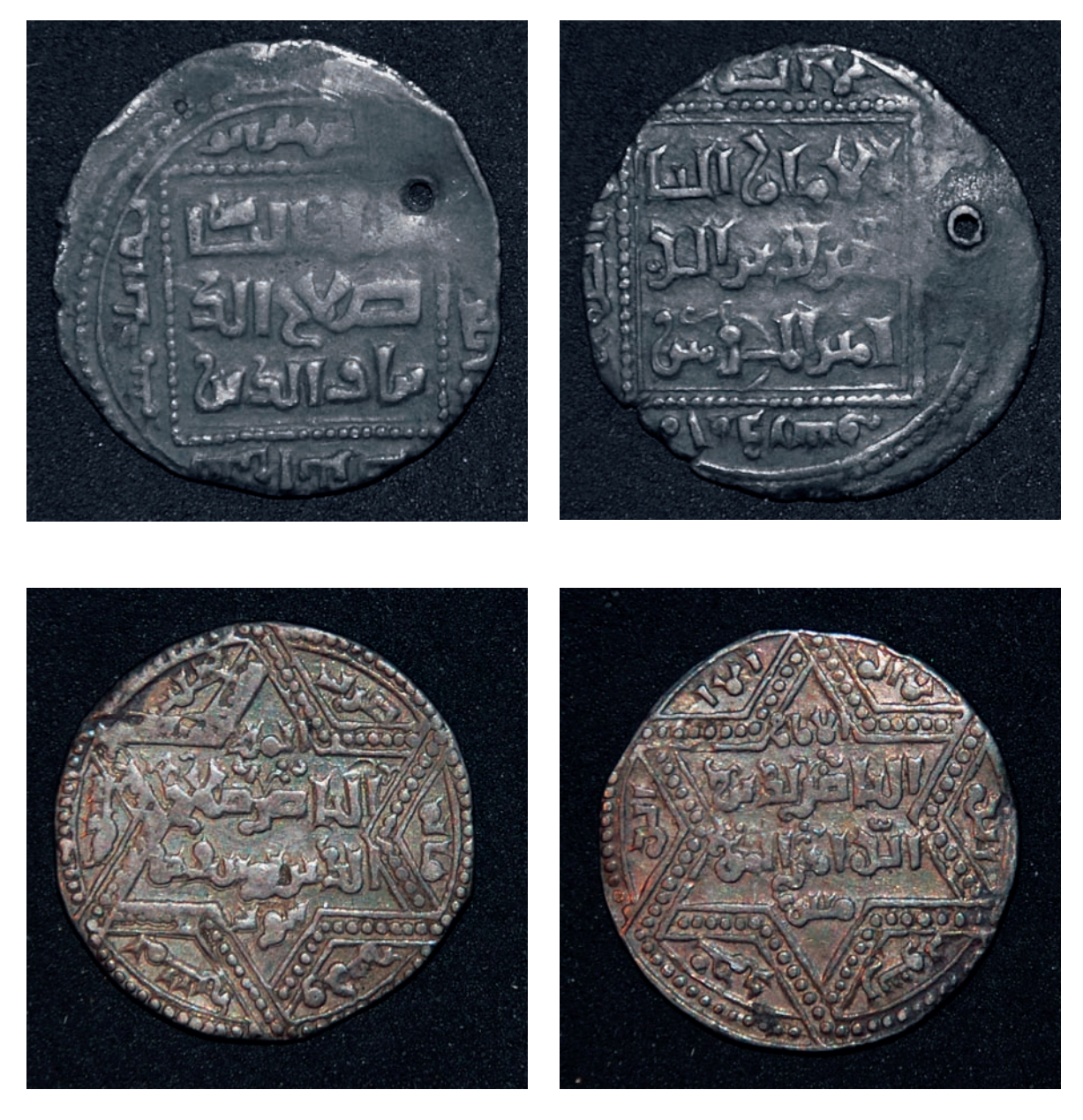
Figure 4. Ayyubid square in a circle style dirham, Salah al-Din, Dimashq, 582 (Dar al-Kutub cat. 2309 / 1778); Ayyubid six-pointed star style dirham, Şalāḥ al-Dīn, Halab, 585 (Dār al-Kutub cat. 2297 / reg. 1173.

Saladin's son al-'Azīz 'Uṯmān (Egypt: 589-592 / 1193-1195) introduced Naskh script on his Damascus square-in-circle dirhams from 593/1197 but not on the dirhams or dinars of the Cairo mint. Here script distinguished two mints since both had the same square-in-circle layout.<sup>23</sup> In this case it is not possible to argue that the use of Naskh was a marker of Sunni Islam or sultanic power since it was used on silver before gold, on coins from one mint but not others, and not by the ruler who had established Sunni rule in place of that of Fatimid Ismā'īlī