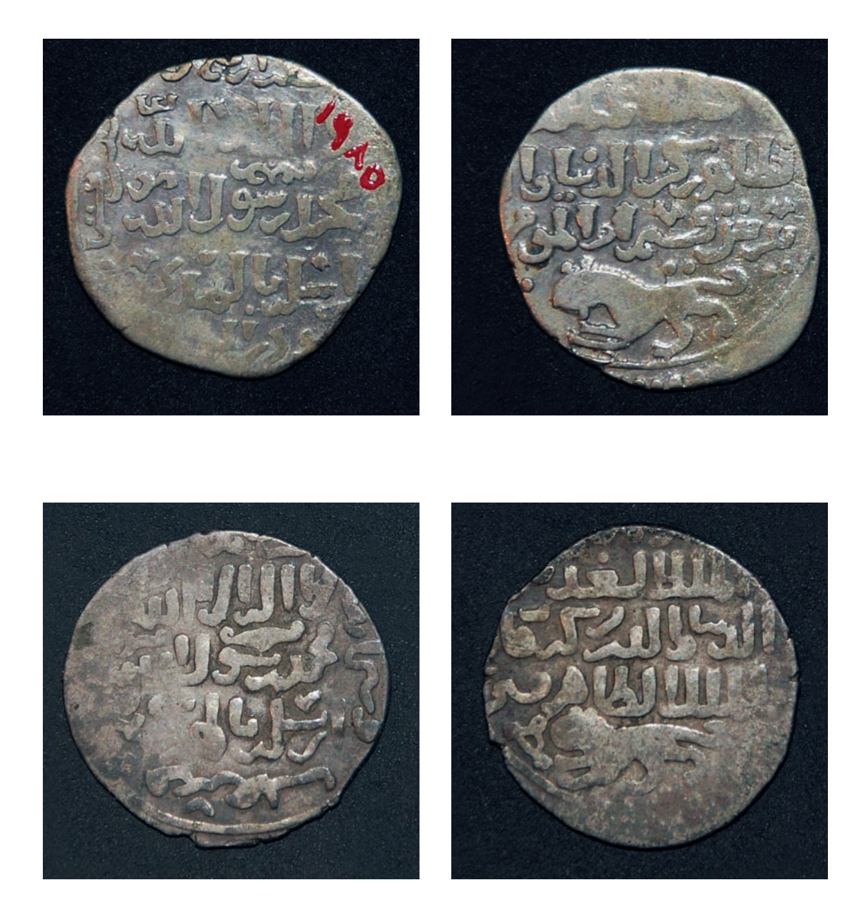
Figure 7. Mamlūk dirham with lion, al-Ṣāhir Baybars, dinar al-Iskandariyya, xx2 (Dār al-Kutub cat. 2518 / reg. 1985); Mamlūk dirham with lion, Baraka Qan, dirham, Dimašq, 678 (Dār al-Kutub, 2553 / reg. 2018).