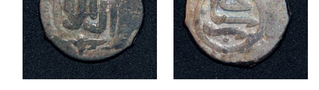
Figure 12. Mamlūk dirham, al-Nāșir Muḥammad, Dimašq, 732 ( Dār al-Kutub cat. 2614 / reg. 4195); Mamlūk maydānī style dirham, al-Ašraf Barsbāy, Ḥalab, ND ( Dār al-Kutub cat. 2931 / reg. 2348). Reproduced with the permission of the Egyptian National Library.