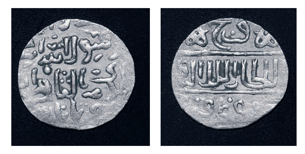
Figure 9. Mamlūk al-Nāṣirī style dinar, al-Nāṣir Faraj, al-Qāhira, 814 (Dār al-Kutub cat. 2879/ reg. 2312).

These Nāṣiri dinars were distinct from earlier Mamluk gold coinage in terms of the layout of the inscriptions and their relationship to a theoretical Muslim weight standard. The reverse field was divided into three zones with Farağ's name in the top third, some of his titles in the middle, and his father's name in the bottom. Visually the layout of the coins paralleled the all-calligraphic three-field layout or shield design associated with Mamluk sultans as a heraldic device or blazon beginning with the third reign of al-Nāṣir Muḥammad b. Qalā'ūn (709-741/1310-1341) and found on many of their buildings as well as their copper coinage. The new design was a visual signal that these al-Nāṣiri dinars were struck according to the canonical weight of the miṯqāl (4.25 grams) and, in theory, could be traded by number rather than by weight. Unfortunately Farağ had neither the gold resources nor the political power to make his attempted monetary reform work.