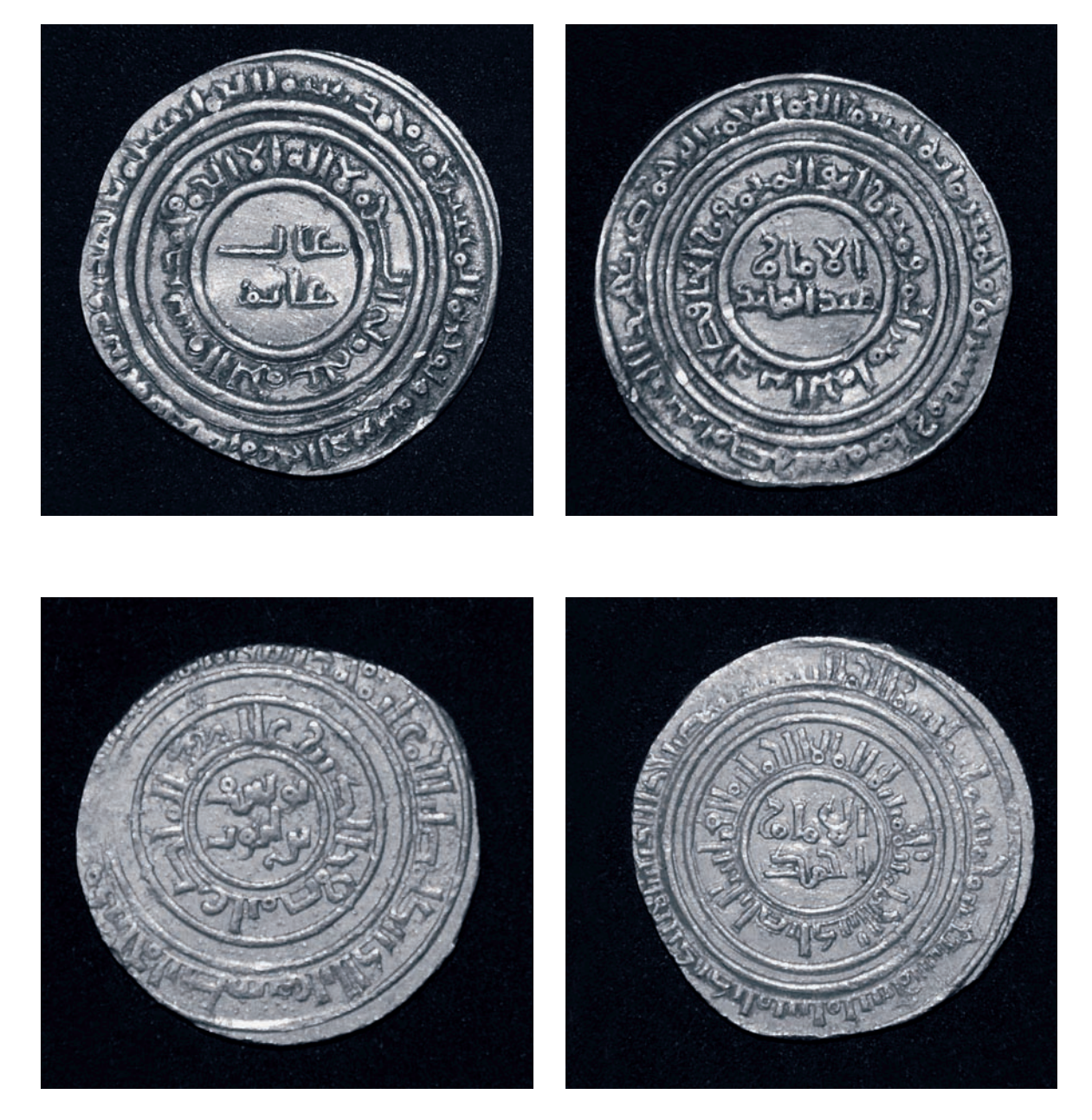
Figure 3. Fatimid "bullseye" style dinar, al-Hāfiz li-Dīn Allāh, Miṣr, 528 (Dār al-Kutub cat. 2246 / reg. 1695); Ayyubid "bullseye" style dinar, Şalāḥ al-Dīn (Saladin), al-Iskandariyya, 579 (Dār al-Kutub cat. 2267 / reg. 1753). Reproduced with the permission of the Egyptian National Library.

time it was in the form of a six-pointed star within a circle. It was easy to distinguish these new style dirhams from both earlier Zangid dirhams and even dirhams struck by Saladin in other parts of Bilad al-Sham and Egypt. If these particular designs carried "meaning" in addition to being an easy way to distinguish the products of one Ayyubid set of mints [Cairo, Damascus, etc.] from another [Aleppo] and from all previous silver issues, memory of that symbolism has been lost.