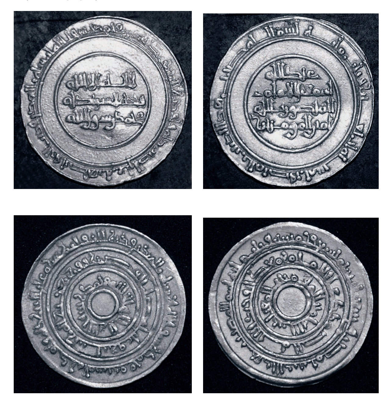
Figure 1. Early style Fatimid dinar, al-Manṣūr billāh, al-Manṣūriyya, 340 (Dār al-Kutub cat. 1826 / reg. 1313); Fatimid "bullseye" style dinar, al-Mu'izz li-Dīn Allāh, Miṣr, Ša'bān 359. (Dār al-Kutub cat. 1834 / reg. 1332).

understanding, an outer or z\bar{a}hir , which all Muslims understood and an inner or b\bar{a}tin known only to those properly initiated.<sup>12</sup>