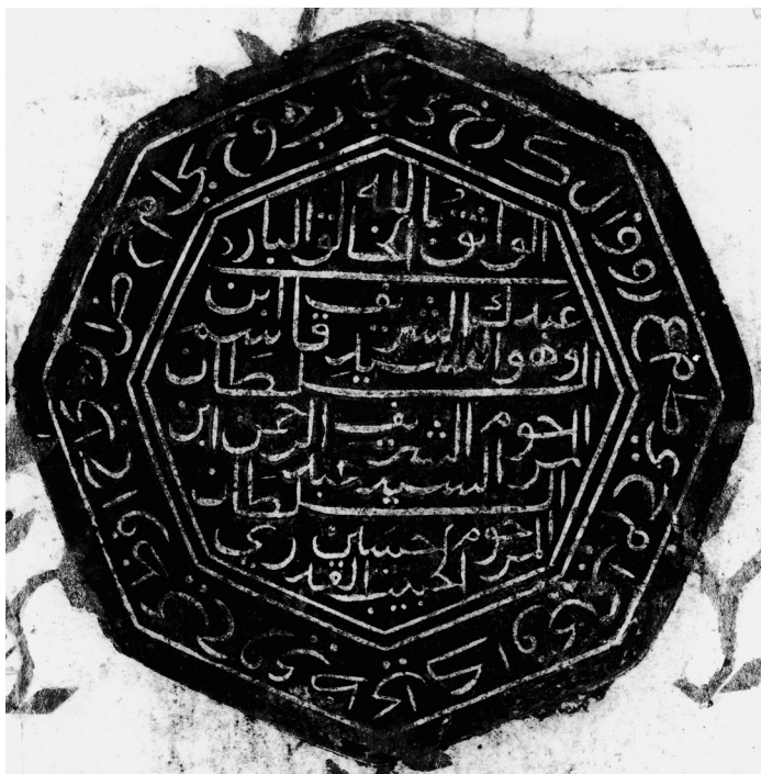
Fig. 3. Seal of Sultan Syarif Kasim of Pontianak, on the west coast of Kalimantan, impressed in lampblack on a letter to Thomas Stamford Raffles in Melaka, 16 Safar 1226 (12 March 1811), with the word billāh placed at the top.