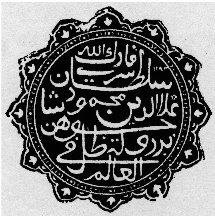
Fig. 5. Seal of Sultan Alauddin Mahmud Shah of Aceh (r. 1760-1781), from a lithographed chart of royal Aceh seals, with the word Allāh raised four lines and placed at the top.

#823; diameter 45 mm; inscribed: Paduka Seri Sultan Alauddin Mahmud Syah johan berdaulat zill Allāh fi al-'ālam 1182 , 'Paduka Seri Sultan Alauddin Mahmud Shah, the champion endowed with sovereign power, the shadow of God on earth, 1182' (AD 1768/9). Leiden University Library, Or.8244.