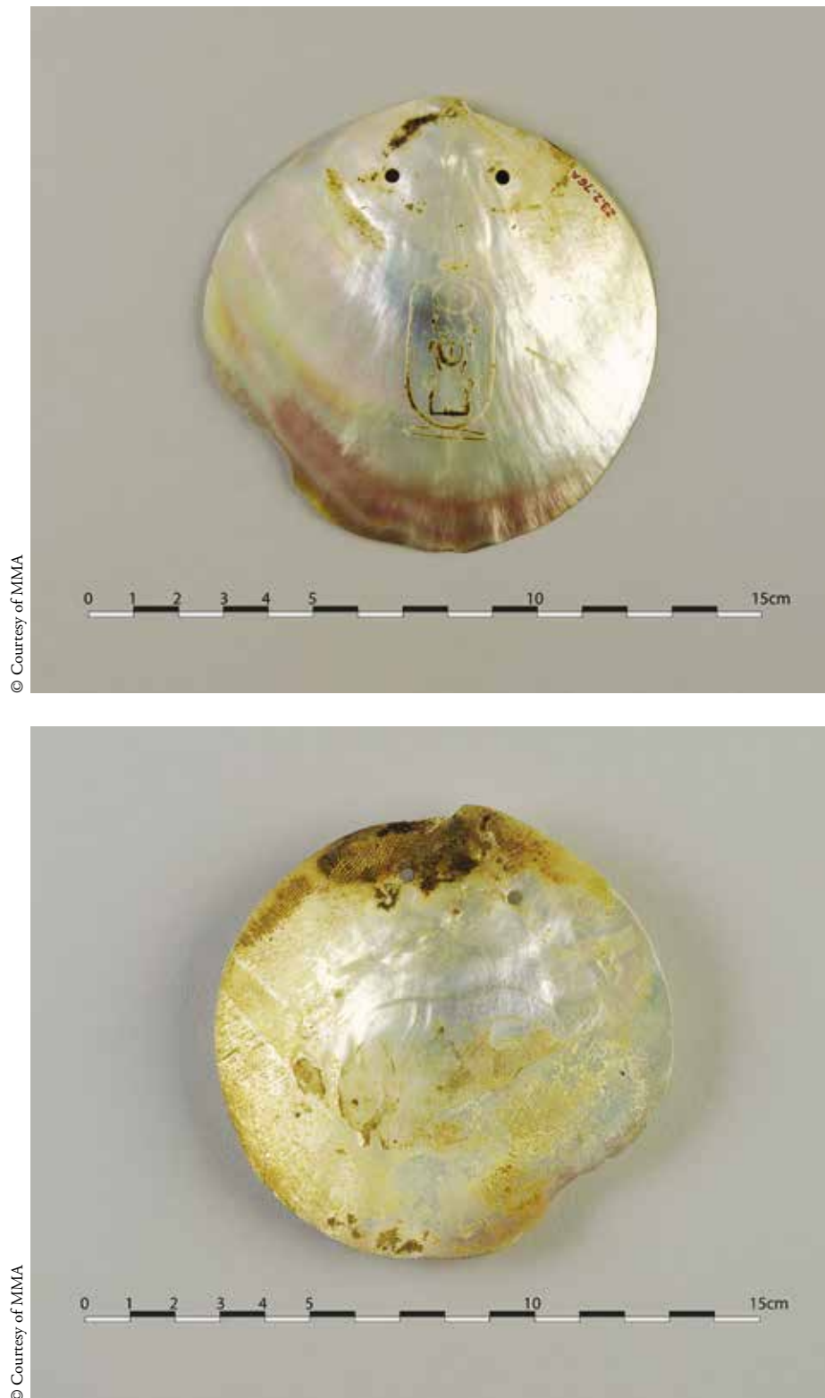
FIG. 1. Front and back of MMA 23.2.76a.