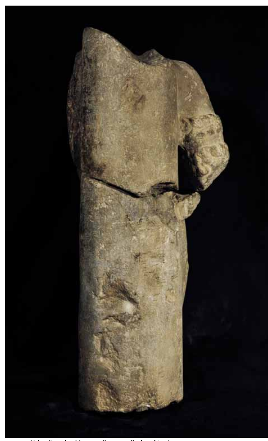
FIG. 4. Cairo, Egyptian Museum, Basement Register N. 967.