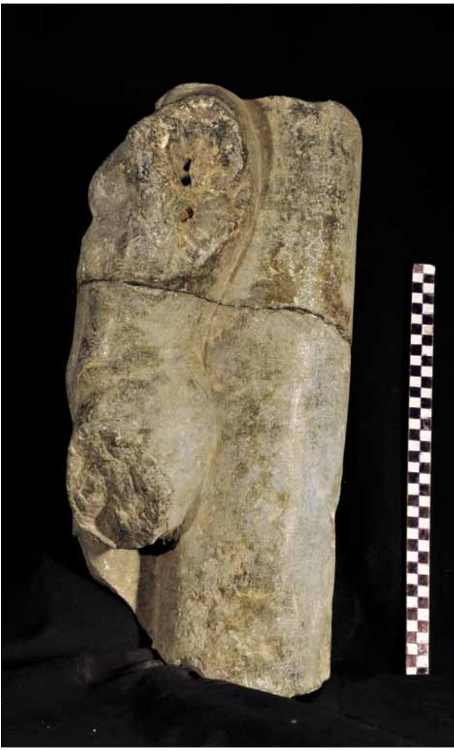
FIG. 3. Cairo, Egyptian Museum, Basement Register N. 967.