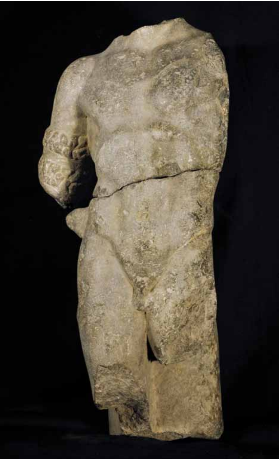
FIG. 1. Cairo, Egyptian Museum, Basement Register N. 967.