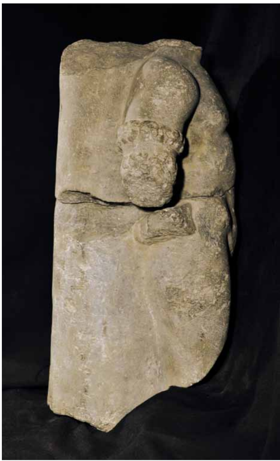
FIG. 2. Cairo, Egyptian Museum, Basement Register N. 967.