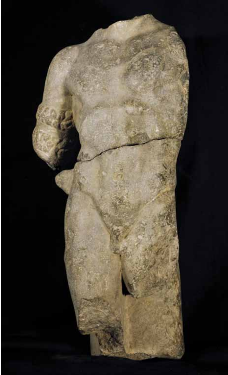
FIG. 1. Cairo, Egyptian Museum, Basement Register N. 967.