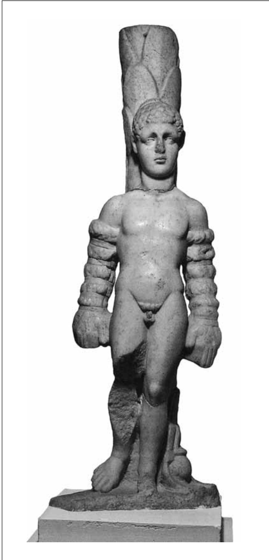
FIG. 5. Kos Archaeological Museum, inv. 106, after Feuser 2013, cat. 19, pl. 6.2.