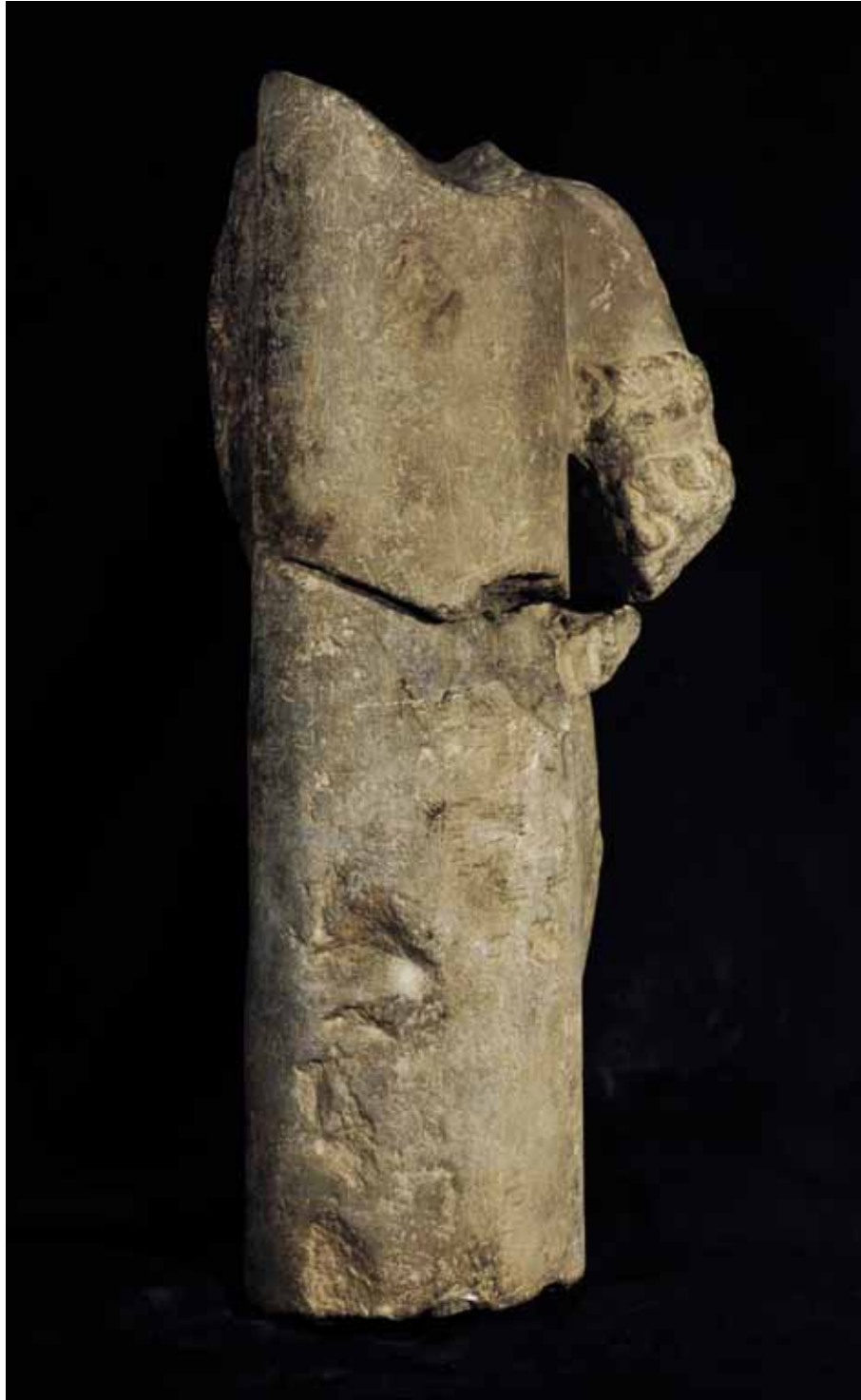
FIG. 4. Cairo, Egyptian Museum, Basement Register N. 967.