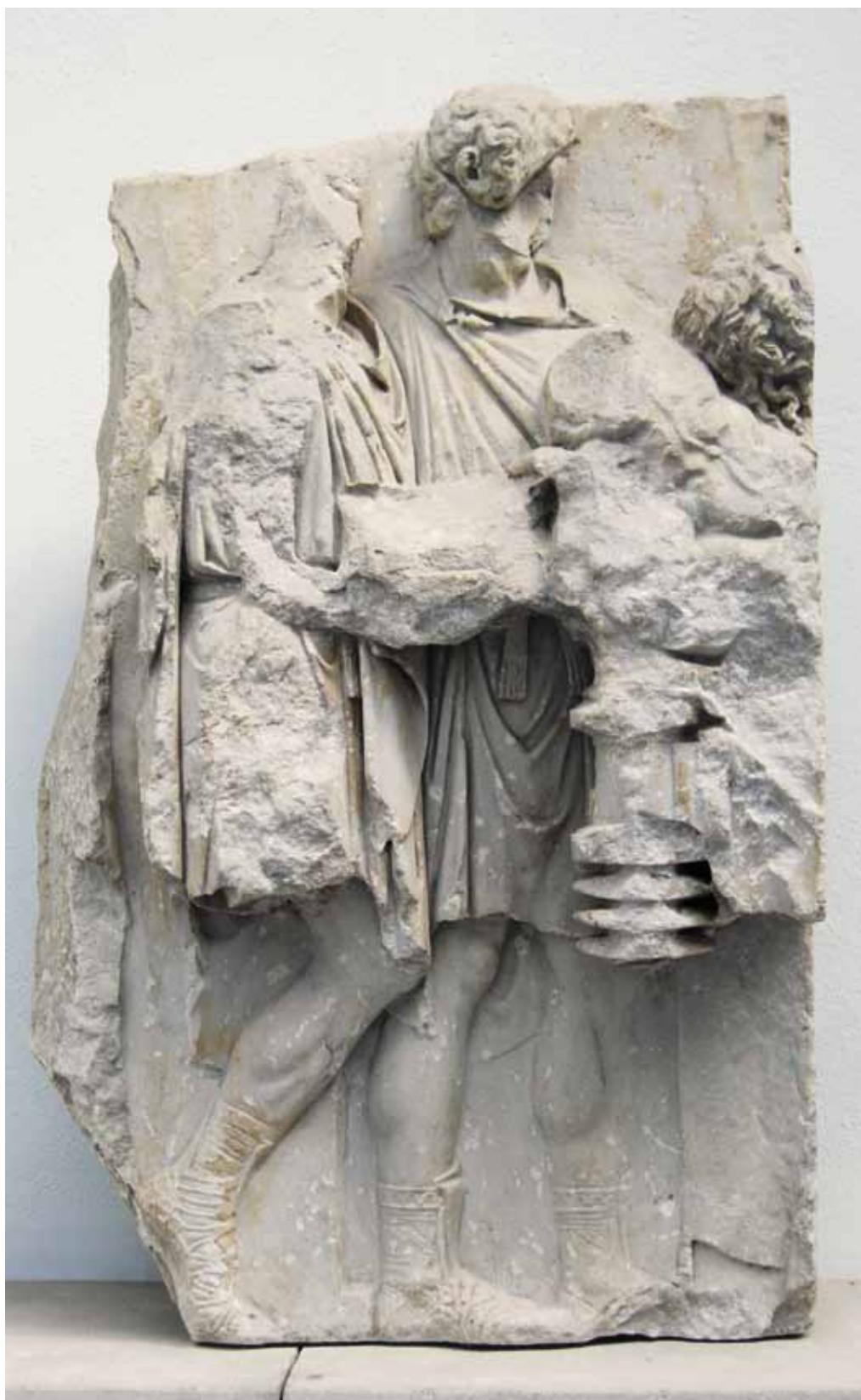
FIG. 19. The Telephus Frieze, Funerary bed scene, after http://www.flickr.com/photos/24729615@Noo/7197866330/sizes/k/in/photostream/ .