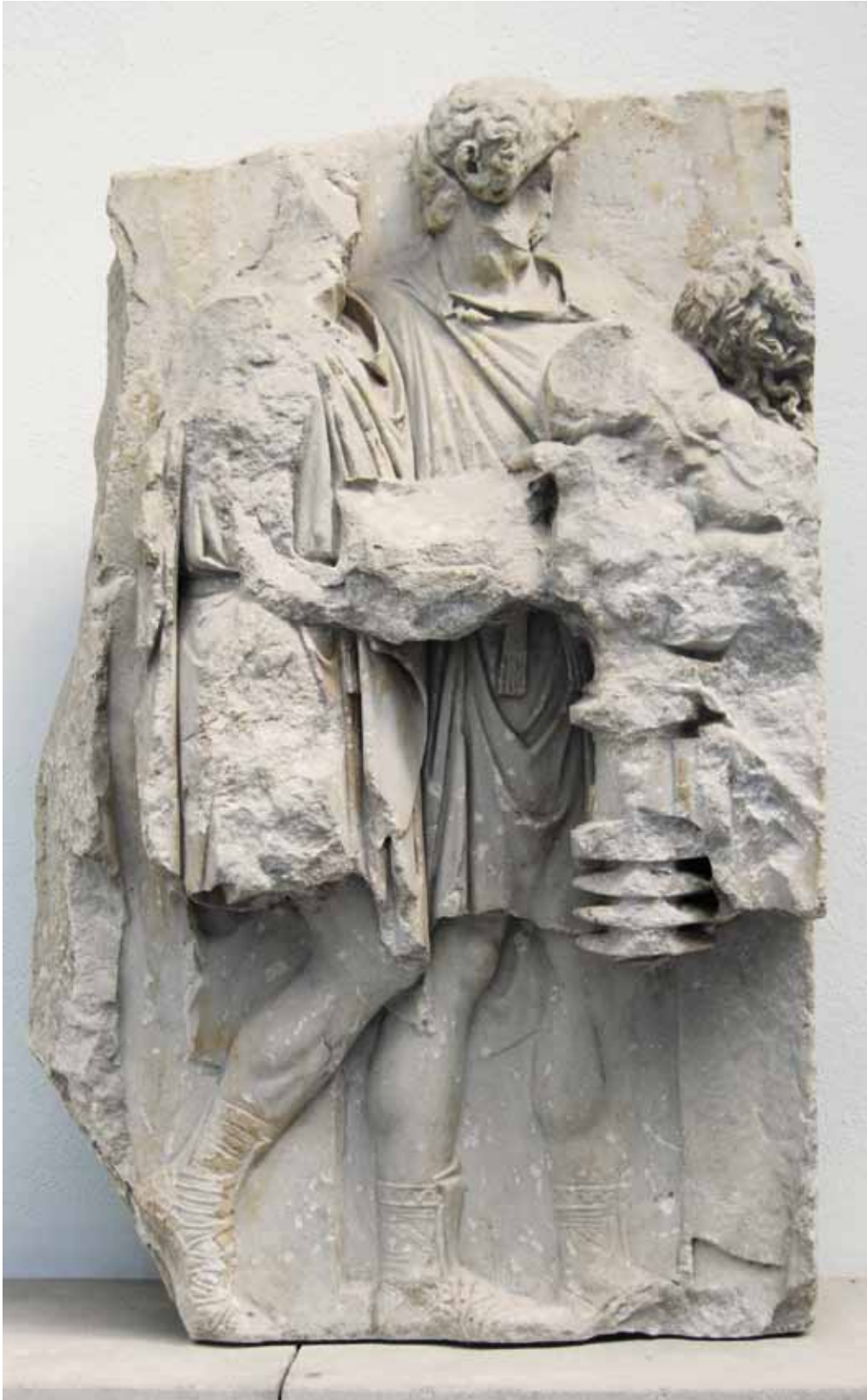
FIG. 19. The Telephus Frieze, Funerary bed scene