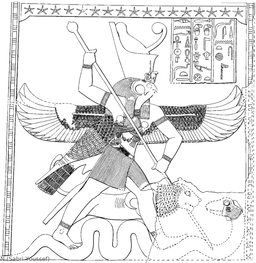
FIG. 6. Seth of Hibis spearing Apopis, scale 1:20, after N. de G. Davies,

The Temple of Hibis in el Khargeh BIFAO 111 (2011), p. 13-22 ABD EL-RAHMAN (Sabri Youssef) Amun-hakht Fighting Against an Enemy in Dakhia Oasis: a Rock Drawing in Wadi al-Gemal. Oasis, III, pl. 42. © IFAO 2019