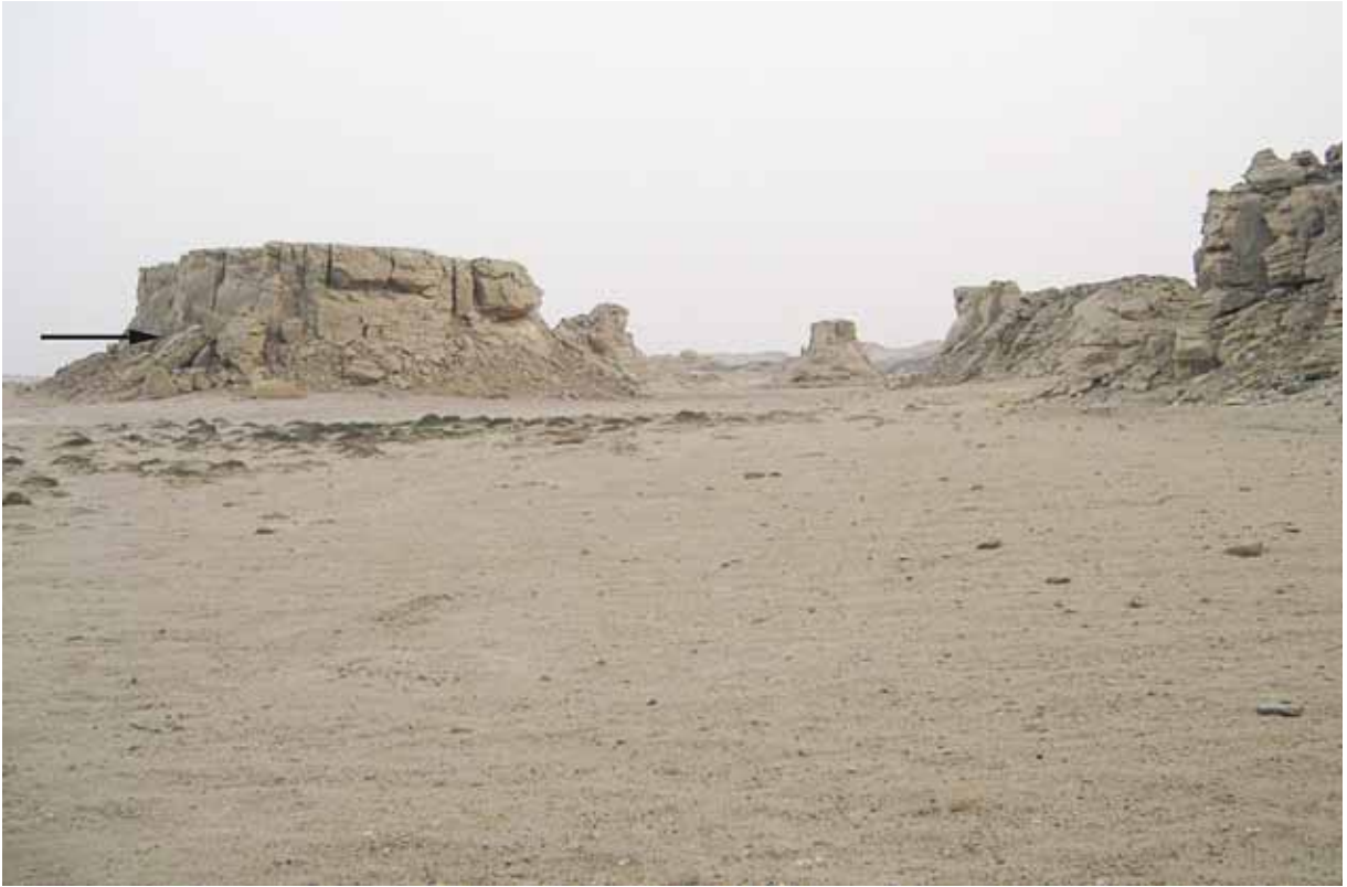
FIG. 1. Dakhla, al-Aqula/Wadi al-Gemal, the hill, view W/E.