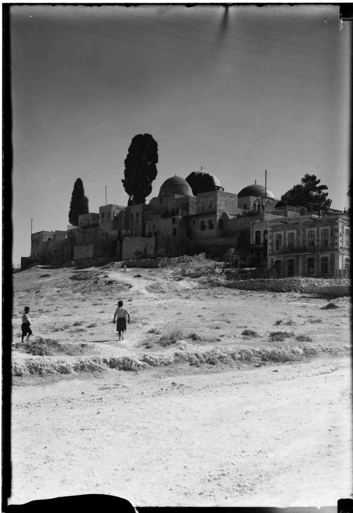
Fig. 2. Elevated View of the Takiyya of Šayḥ Abū Bakr, Aleppo.